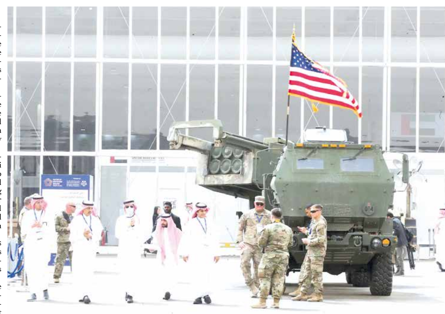
Saudi men near a US Army defence system on display at World Defense Show in Riyadh in March. (Image used for illustrative purposes only)

"I affirmed to him the Saudi-led coalition's backing of the Yemeni Presidential Leadership Council and its supporting enprosperity," Prince Khalid said in a tweet.