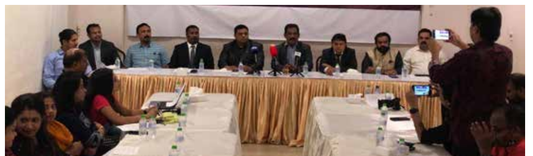
Indian Club officials at the Press conference

The contestants are from different nationalities and they will compete over three rounds (casual, ethnic and eveningwear) followed by Q and A for the final round. Along with the Crown, First Runner Up, Second Runner Up, and other four individual category awards - Best Walk, Best Smile, Best Hair-Do and Audi-