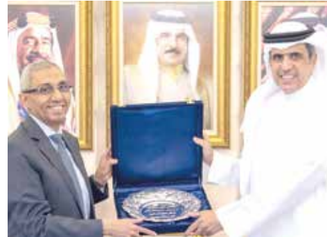
Information Affairs Minister Ali bin Mohammed Al Romaihi received yesterday the Egyptian Ambassador to Bahrain, Yasser Mohammed Ahmed Shaban. The Minister lauded the deep-rooted solid fraternal Bahraini-Egyptian relations.