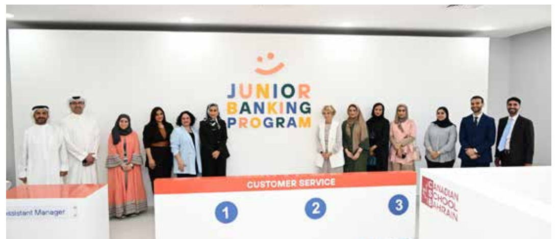
Officials during a group photo opportunity

Marketing and Communication at Al Salam Bank revealed, "Al Salam Bank representatives will ensure that the students are provided with the support and guidance needed for them to gain a