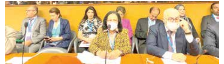
Health Minister speaks at the event

Also on its agenda was the draft consolidated speech of the