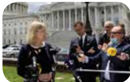
Finland and Sweden should be allowed to join the military alliance. "I stated that as NATO allies Finland and

Turkey will commit to each other's security and our relationship will thus grow stronger," Niinisto tweeted after the call. "Finland condemns terrorism in all its forms and manifestations. Close dialogue continues."