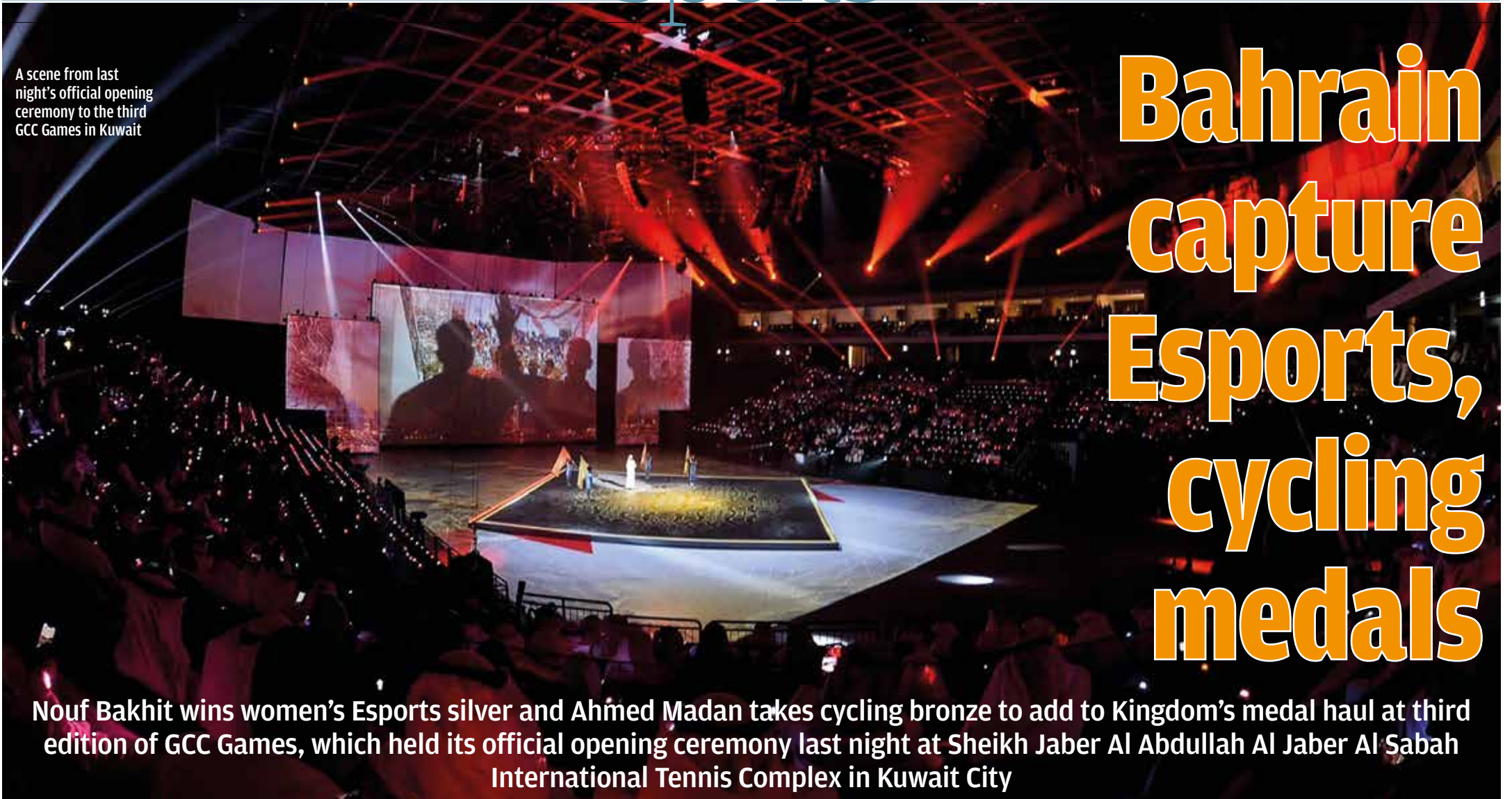
A scene from last night's official opening ceremony to the third GCC Games in Kuwait