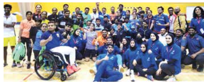
Indian athletes after the event