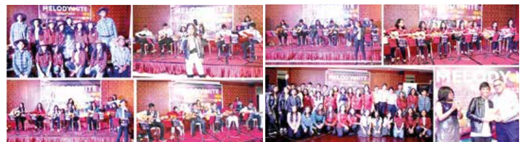
Participants at the event