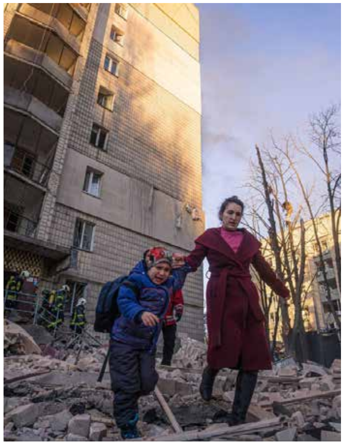
A woman with a child evacuates from a residential building damaged by shelling, as Russia's attack on Ukraine continues, in Kyiv, Ukraine

Given this, Monday's ceremony will likely signal an agreement to start discussions on IPEF rather than actual negotiations, the sources said.