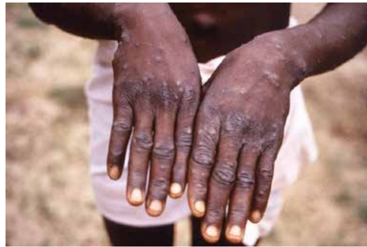
Reuters | London

The World Health Organisation said it expects to identify more cases of monkeypox as it expands surveillance in countries where the disease is not typically found. As of Saturday, 92 confirmed cases and 28 suspected cases of monkeypox have been reported from 12 member states that are not endemic for the virus, the U.N. agency said, adding it will provide further guidance and recommendations in coming days for countries on how to mitigate the spread of monkeypox. "Available information suggests that human-to-human transmission is occurring among people in close physical contact with cases who are symptomatic", the agency added. "What seems to be happening