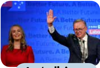
Australia's Labour to retake power after 9 years

◆ Australia's Labour Party will form the country's next government today as unprecedented support for the Greens and climate-focused independents ended nearly a decade of rule by the conservative coalition. Centre-left Labor remains four to five seats short of a majority of 76 in the 151 seat lower house with about a dozen electorates too close to call, television channels reported on Sunday. Labor may need the support of independents and smaller parties to return to power for the first time since 2013. Labour leader Anthony Albanese said he will be sworn in as the 31st prime minister on Monday along with four senior party members, before heading to Tokyo to attend a "Quad" summit on Tuesday with U.S. President Joe Biden and the prime ministers of Japan and India.