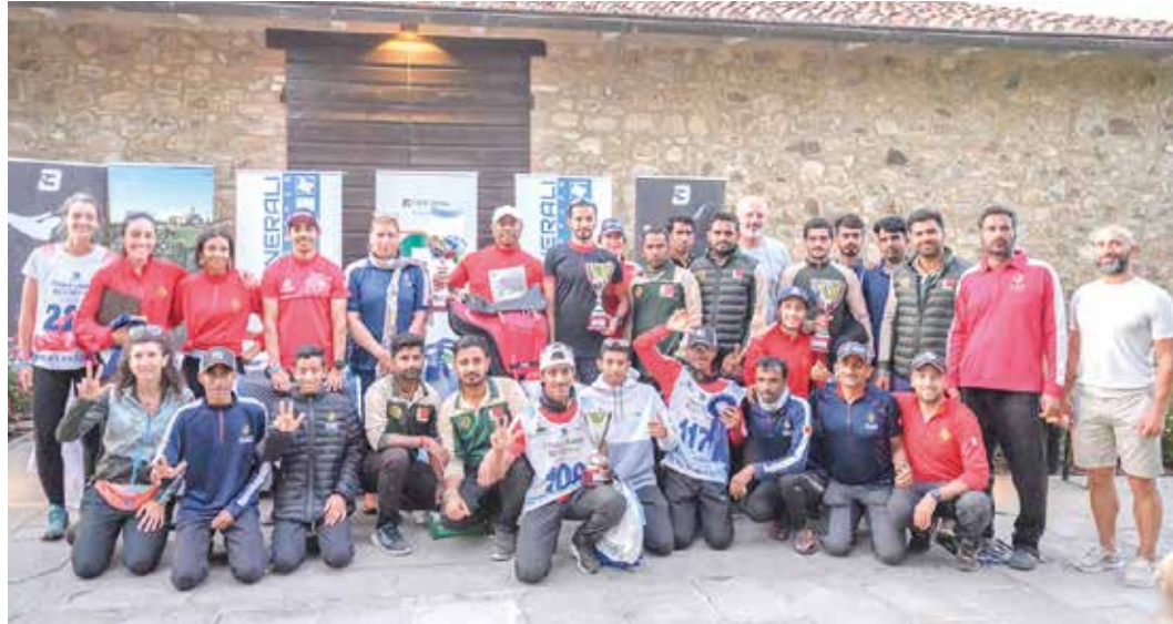
Royal Endurance Team celebrate with the trophies

On this occasion, HH Shaikh Nasser asserted that these good results achieved by the Royal