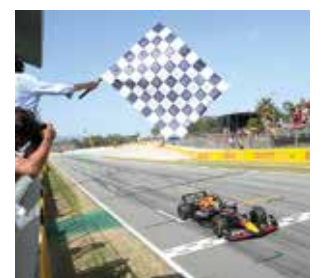
Verstappen crosses the line