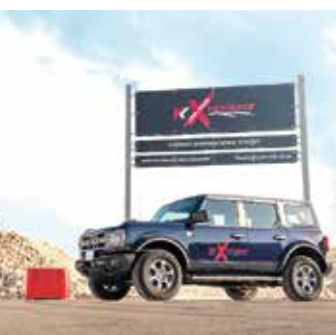
A Ford Bronco Big Bend is seen ahead of Y.K. Off-Road Experience at BIC

The Bronco is a legend amongst high-end SUVs built with the extreme adventure seeker in mind. This makes it