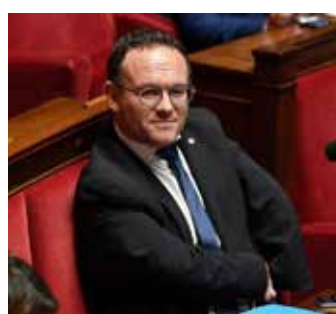
Member of Parliament Damien Abad

Damien Abad, France's newly appointed minister for Solidarity and the Disabled, strongly denied he raped two women, following accusations published on Sunday by the Mediapart website in an article based on interviews with the women. The women quoted by Mediapart said Abad had forced them to have unwanted sexual relationships with him. The actions happened in late 2010 and early 2011, they said. One of the women filed a complaint to the police against Abad in 2017 which was closed without further action, Abad and Mediapart said. "I contest with the greatest force these accusations of