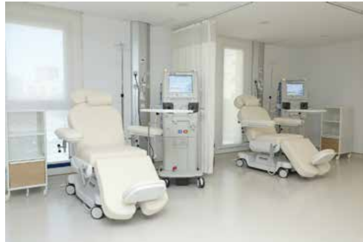
The dialysis facility at the centre

The Dialysis Centre is set in a serene, state-of-the-art facility