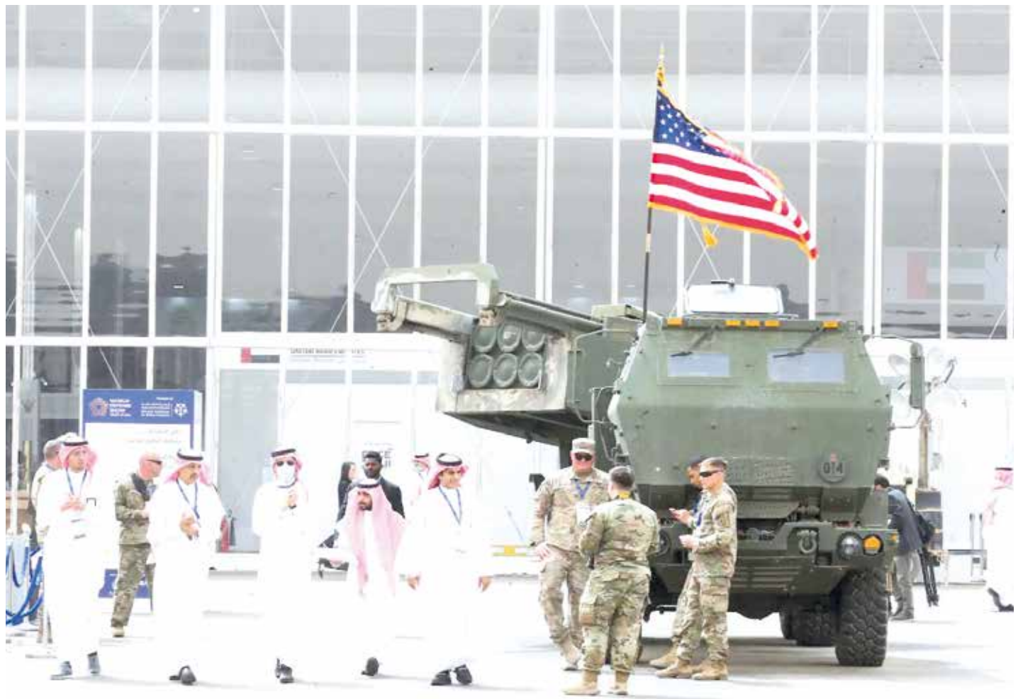
Saudi men near a US Army defence system on display at World Defense Show in Riyadh in March. (Image used for illustrative purposes only)

"I affirmed to him the Saudi-led coalition's backing of the Yemeni Presidential Leadership Council and its supporting entities, and our aspirations for reaching a comprehensive political resolution to the crisis that will lead Yemen into peace and prosperity," Prince Khalid said in a tweet.