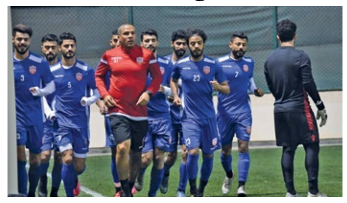
Bahrain players warming up on the pitch at the start of training

B ahrain's men's national Bahrain are scheduled football team have kicked to take on their Cambodian off their local training for their counterparts on March 26 in upcoming joint-qualifier next their next qualifier, while their month against Cambodia, for friendly games are against the Fifa World Cup 2022 and Malaysia on March 21 and the AFC Asian Cup 2023.