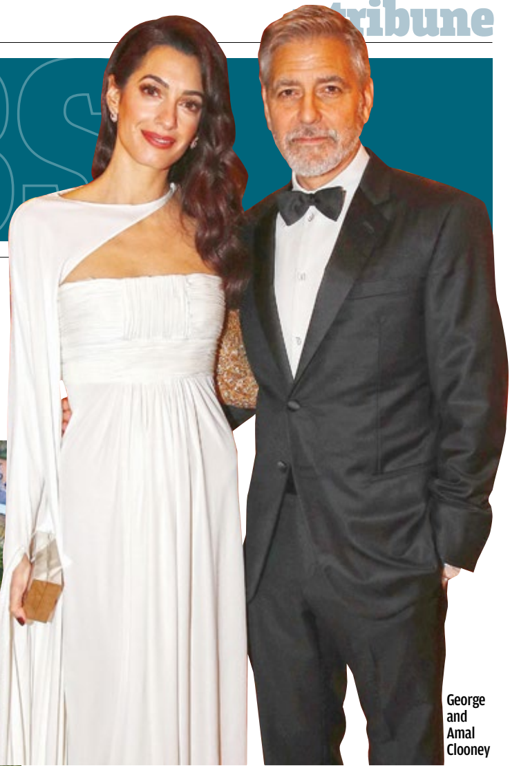
George and Amal Clooney

He will next be seen in the self-directed post-apocalyptic drama, "The Midnight Sky". The film is based on the novel "Good Morning, Midnight" by Lily Brooks-Dalton, and co-stars Felicity Jones, Kyle Chandler, David Oyelowo and Tiffany Boone. Shooting for the Netflix-distributed film began on October 21 2019, and a release date is yet to be confirmed.