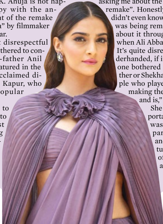
Sonam K. Ahuja

She said that it is important as her father was an important part of the film and the film in turn is a part of his legacy.