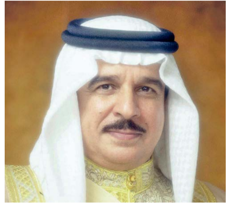
His Majesty King Hamad bin Isa Al Khalifa