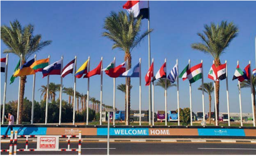
Sharm el Sheikh city hosts the first Arab-EU Summit

"We will have frank, open discussions, not only on migration, definitely not," Mogherini told