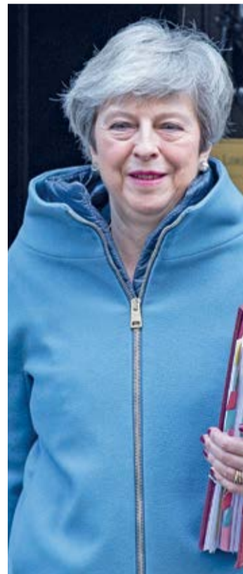
British Prime Minister Theresa May