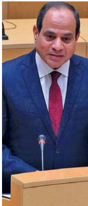
Egypt's President Abdel Fattah el-Sisi