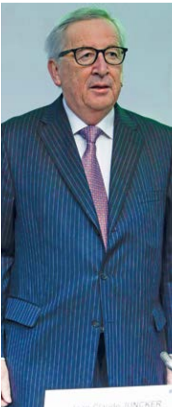
Jean-Claude Juncker, the president of the European Commission