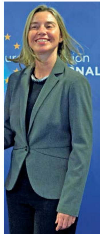
EU foreign policy chief Federica Mogherini