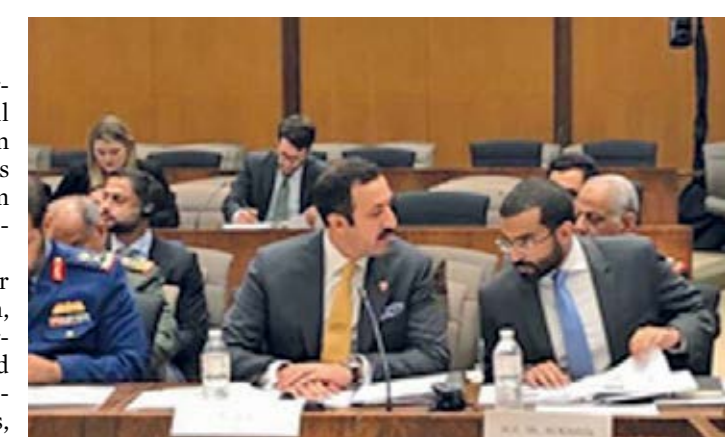
Bahraini delegates at MESA meeting

Speaking during the Middle regional security. East Strategic Alliance (MESA) He told MESA participants ance with our vision - there is gic alliance for the Middle East on political and security frame- that Bahrain is looking forward no security without develop- to ensure security and stability