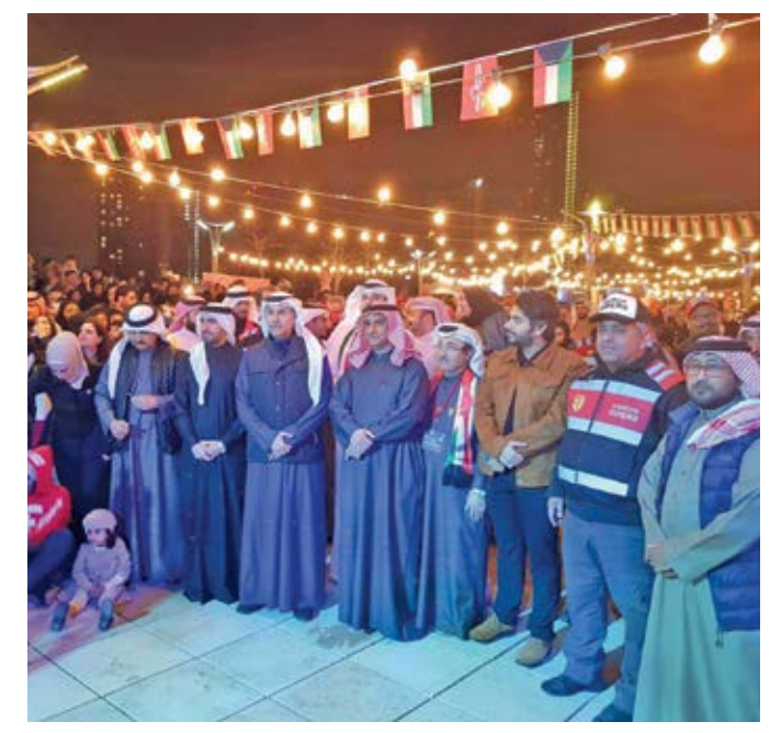
First Hala Febrayer Festival organised in Bahrain under the patronage of Shaikh Hisham Bin Abdulrahman Al Khalifa, the Governor of the Capital Governorate yesterday at 7:00 pm in Water Garden City project located in Seef area opposite to City Centre. Above, scenes from the event