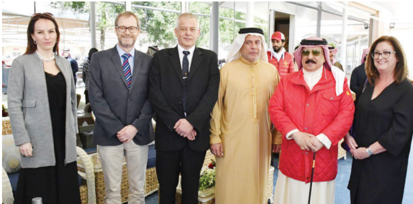
His Majesty with members of BSPCA.

‘Royal directives contributed towards preventing cruelty against animals’