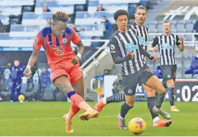
Tammy Abraham of Chelsea shoots to score

Chelsea climbed to the top of the Premier League for the first time in more than two years with a convincing 2-0 win at Newcastle, while Brighton survived late penalty controversy to secure their first ever victory at Aston Villa yesterday.