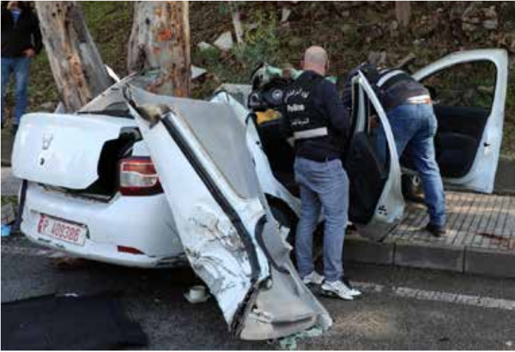
Lebanese police inspect a damaged car after fugitives crashed it into a tree

Speaking to AFP, she said she did not rule out the possibility of