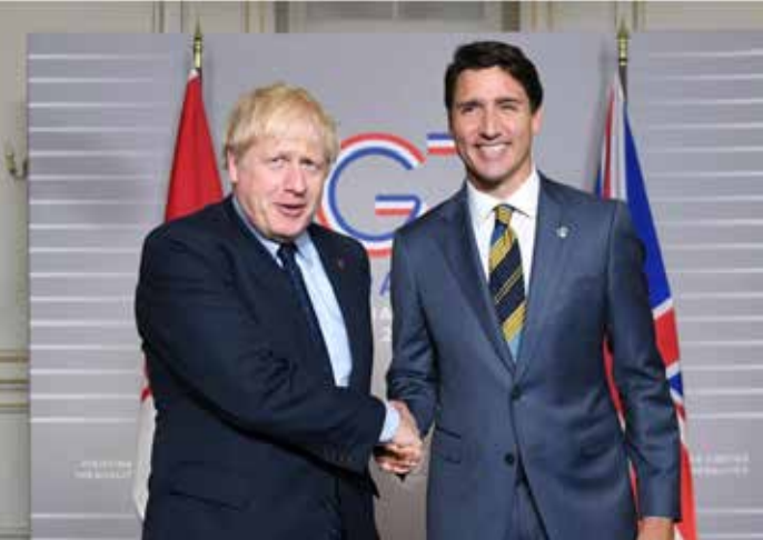
Britain's Prime Minister Boris Johnson shakes hands with Canada's Prime Minister Justin Trudeau at the G7 summit in Biarritz, France

Britain and Canada struck a rollover trade deal yesterday to protect the flow of $27 billion-worth of goods and services between them after Brexit, and vowed to start talks on a bespoke agreement next year. As Britain prepares to end its transition out of the European Union on Dec. 31, it has negotiated multiple rollover bilateral deals to maintain trade, with many simply replacing the terms the bloc had already agreed. British Prime Minister Boris Johnson joined Canada's Justin Trudeau and their respective trade ministers on an online call to mark the deal, which paves the way for a tailor-made agreement covering more areas such as digital trade, small businesses, the environment and women's economic empowerment. "Today's agreement underpins 20 billion pounds worth of trade and locks in certainty for thousands of jobs," Liz Truss, the UK's international trade secretary, said in a statement. Her Canadian counterpart