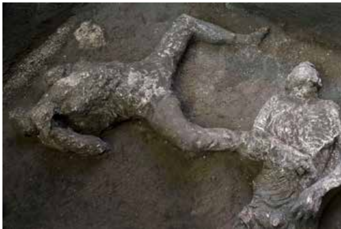
The remains of the two men discovered in Pompeii

The ruined city of Pompeii was submerged in ash after the eruption of Mount Vesuvius in 79 AD. It is now Italy's sec-