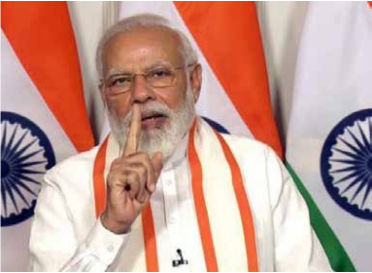
India’s Prime Minister Narendra Modi during his address (file photo)

He also expressed confidence that the country will achieve its