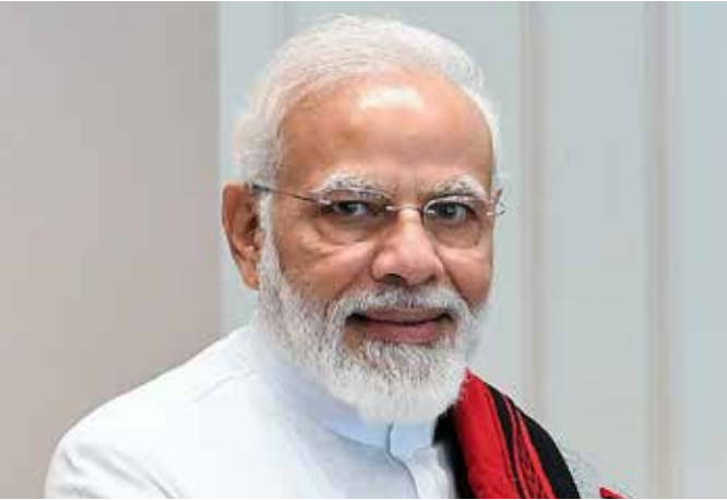
Prime Minister Narendra Modi