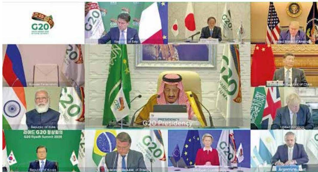
Saudi King delivers G20 summit opening remarks virtually as World leaders watch on

"Although we are optimistic about the progress made in de-