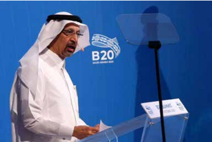
Saudi Arabian Investment Minister Khalid al-Falih, speaks during a virtual meeting of B20 at the Saudi Business Group summit in Riyadh, Saudi Arabia

"I'm glad to say that FDI, my area of focus, in the first half has been reported to increase by 12pc compared to last year," Falih, who previously chaired state oil company Saudi Aramco, told a G20