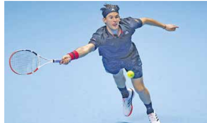
Dominic Thiem hits a return to Novak Djokovic AFP | London

Dominic Thiem recovered from squandering four match points in a dramatic second-set tie-break to beat Novak Djokovic in three pulsating sets in the last four at the ATP Finals yesterday.