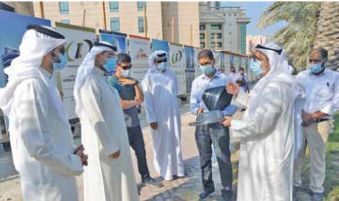
Officials during a visit to discuss methods of treating infested palms