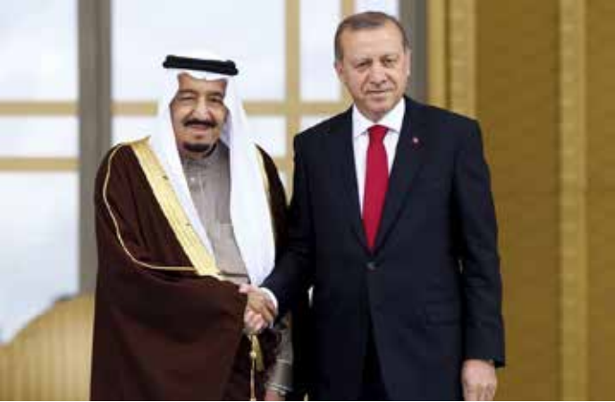
Turkey's President Tayyip Erdogan and Saudi King Salman shake hands during a welcoming ceremony in Ankara, Turkey

For more than a year, some Saudi and Turkish traders have speculated that Saudi Arabia