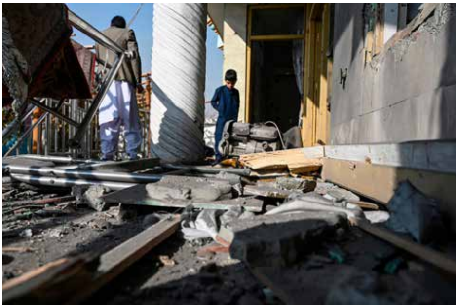
People inspect a damaged house after several rockets land at Khair Khana, north west of Kabul