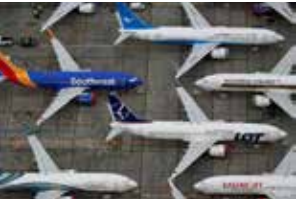
Grounded Boeing 737 MAX aircraft are seen parked at Boeing facilities at Grant County International Airport in Moses Lake, Washington, US