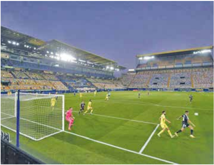
General view inside the stadium during the match

But another slip means Madrid have now won only three of their last seven games in all competitions, with a crucial visit to Inter Milan to come in the Champions League on