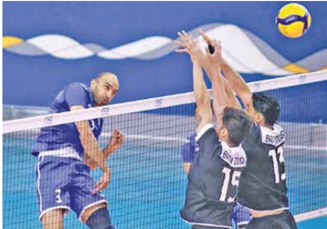
Action from Al Nasser's victory last night

● Al Nasser clinch victory over Bani Jamra