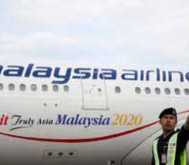
An airport employee beside a Malaysia Airlines plane at Kuala Lumpur International Airport in Sepang, Malaysia

Falih said the Saudi economy, which has been hit by the double blow of the pandemic and lower oil prices, had shown resilience this year and had a proven ability to withstand shocks.