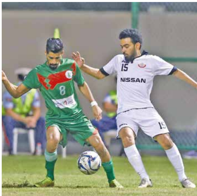
Action from Isa Town's win against Ittifaq

Malkiya were able to register their first victory of the tournament after narrowly losing their previous match to Sitra, while Ahli were making their first appearance in the competition and began their campaign