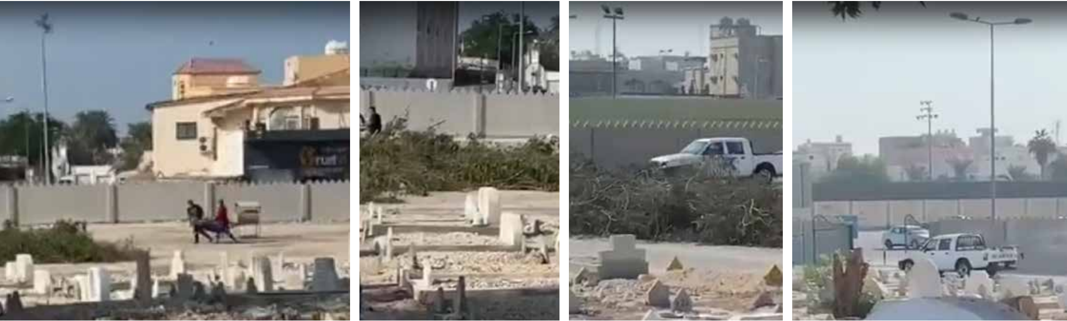
Screengrabs of a video posted by AlAyam

Police arrest two for hunting birds in a cemetery in Muharraq