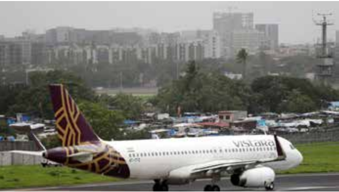
A Vistara Airbus A320 passenger aircraft prepares for takeoff at Chhatrapati Shivaji International airport in Mumbai, India

● Flag carrier Air India is the only Indian airline currently offering direct flights to the US