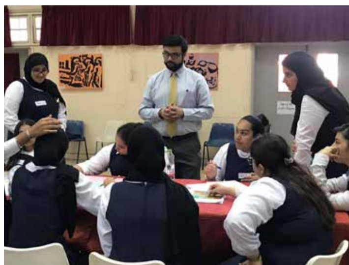
Over 100 final year high school students (Tawjeehi) participated in the event. Above, the camp held at the Al-Istiqlal Secondary Girls School in Muharrag.