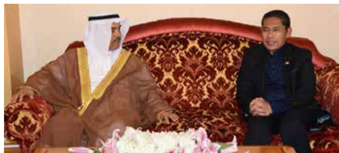
Singapore's Senior Minister of State for Defence and Foreign Affairs Maliki Osman arrived in Bahrain to take part in the 15th Manama Dialogue. He was welcomed alongside his delegation at the airport by Defence Affairs Minister Lieutenant-General Abdullah bin Hassan Al Nuaimi.

The closure effective yesterday will continue until Sunday.