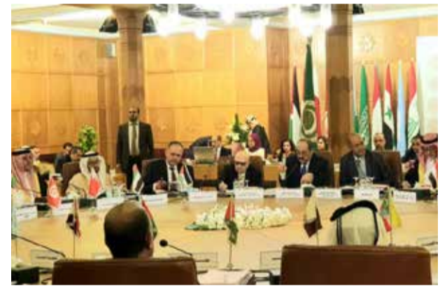
Minister of Justice, Islamic Affairs and Endowments Shaikh Khalid bin Ali Al Khalifa chaired the 35th session of the Arab Justice Ministers Council which convened at the Arab League, in Egypt. He stressed in the opening session the importance of fighting terrorism in the region. The Arab Justice Ministers, the Secretariat General of the Arab Interior Ministers Council, the Gulf Cooperation Council, Naif Arab University for Security Sciences (NAUSS) and the Arab Lawyers Union participated in the meeting.