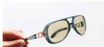
Elvis Presley's original Grand Prix Sunglasses