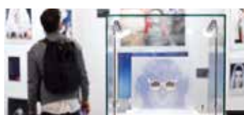
John Lennon's Tinted Prescription "Lost Weekend" glasses

In 2022, the repaired Gibson was sold for 385,000 eu-