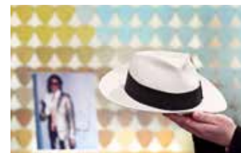
A white fedora hat worn by Michael Jackson in the 1988 smooth criminal music video