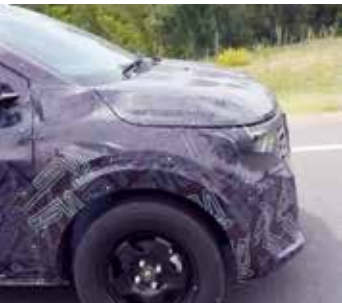
The test mule reveals a hexagonal front grille flanked by

wraparound headlamps, along with what appears to be a revised front bumper featuring a rectangular air dam. Other visible elements include a clamshell bonnet and roof rails. Under the bonnet, the MPV is expected to use the familiar 1.0-litre, 3-cylinder petrol engine, paired with either a 5-speed manual or a 5-speed AMT gearbox. It remains to be seen whether Nissan will also offer the more powerful 1.0-litre turbo-petrol engine option.