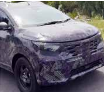
tive identity with a redesigned front fascia.