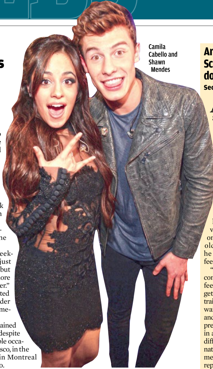
Camila Cabello and Shawn Mendes

Throughout the summer, the duo remained private about their relationship status, despite being spotted kissing in public on multiple occasions, including over coffee in San Francisco, in the ocean in Miami, during a date night in Montreal and in Mendes' hometown of Toronto.