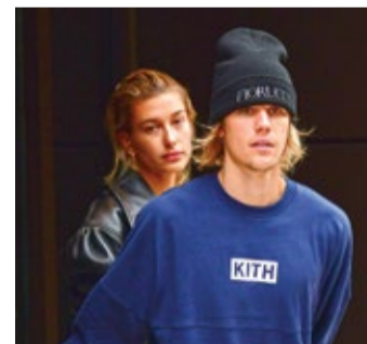
Hailey and Justin Bieber

For the special occasion, the two lovebirds kept things casual but chic. The 25-year-