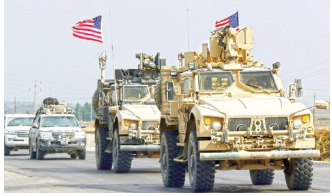
A convoy of United States military vehicles near Bardarash, Iraq, yesterday after leaving northern Syria.