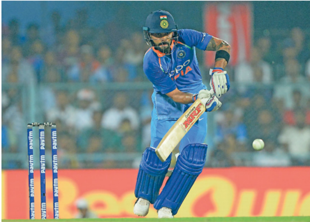
Indian batsman and team captain Virat Kohli plays a shot