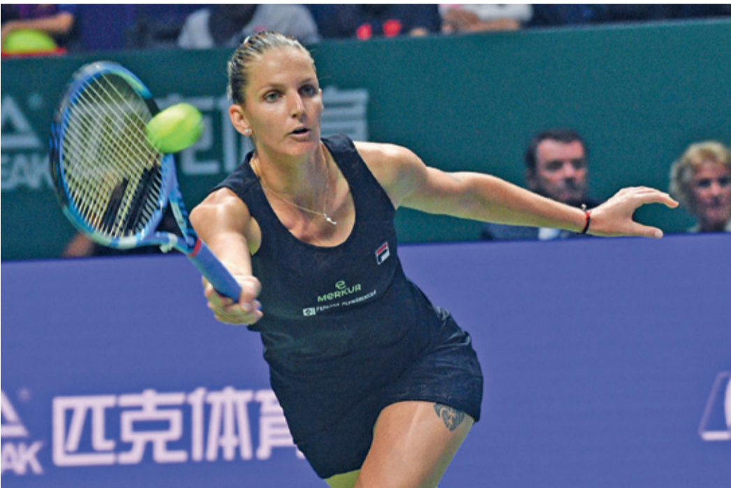
Czech Republic's Karolina Pliskova hits a return against Denmark's Caroline Wozniacki

Wozniacki, who had only played two top-10 players this