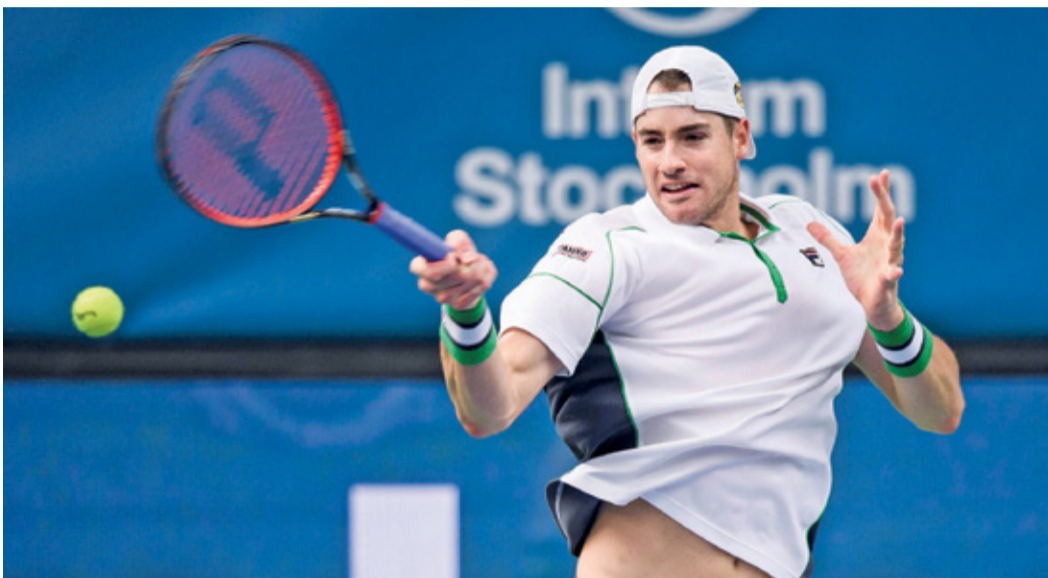
John Isner of US returns the ball to Latvia's Ernests Gulbis during their semi-final at the ATP Stockholm Open

Traditionally, singles matches in Grand Slam tennis tournaments -- the best of five sets for