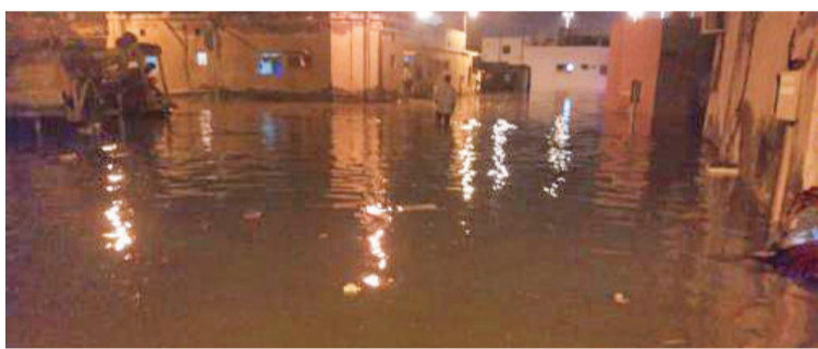
One of the flooded neighbourhoods in West Riffa.