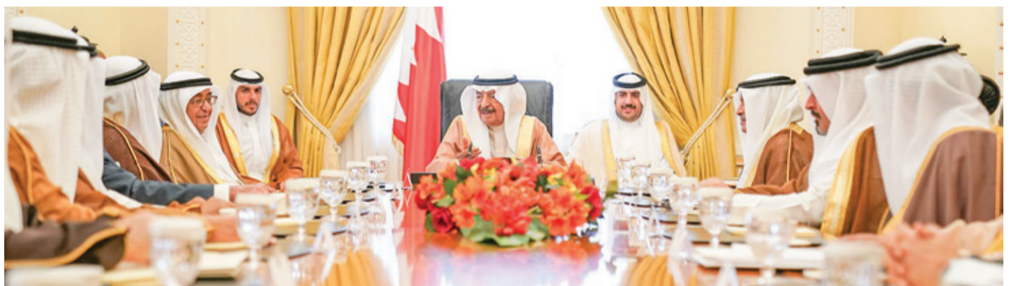
HRH the Premier chairs the meeting.