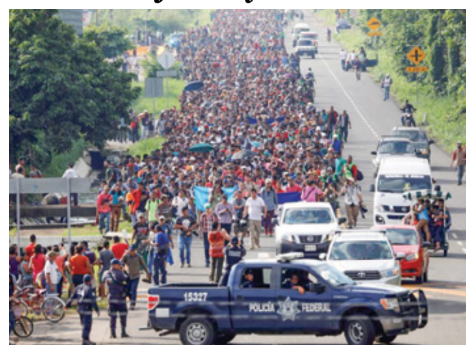
Central American migrants walk along the highway near the border with Guatemala, as they continue their journey trying to reach the US, in Tapachula, Mexico. Crowds of migrants resumed their long journey north on Sunday from the Mexican border city of Ciudad Hidalgo, according to Mexican federal police officers.