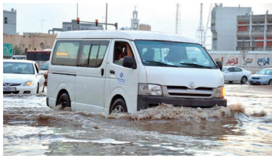
Floodwaters caused traffic disruption in many areas of the Kingdom yesterday.

suction tankers have been deployed to clear floodwaters from across the Kingdom.