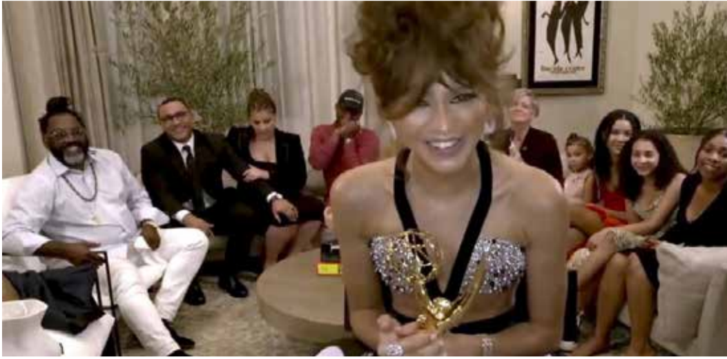
In this video grab, Zendaya accepts the award for outstanding lead actress in a drama series during the 72nd Emmy Awards broadcast

The 24-year-old Zendaya became emotional after she took home the trophy for her role in the HBO series, scoring one of the few long shot victories Sunday night. She is only the second Black actress to claim the lead drama actress award, following Viola Davis’ groundbreaking 2015 win for “How To Get Away With Murder.”