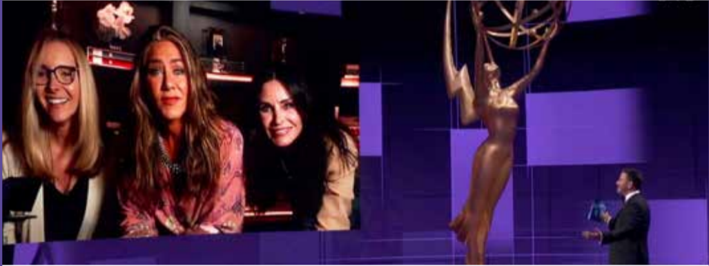
Jimmy Kimmel, right, speaks with actors, from left, Lisa Kudrow, Jennifer Aniston and Courteney Cox during the 72nd Emmy Awards broadcast