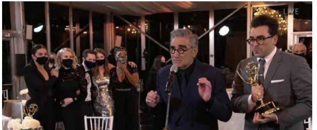
In this video grab, Eugene Levy and Dan Levy accept the award for outstanding comedy series for ‘Schitt’s Creek’ during the 72nd Emmy Awards broadcast