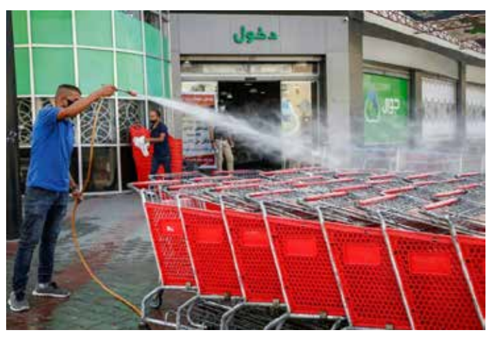
A mask-clad Palestinian worker disinfects supermarket carts

on official statistics, with more er than the national average. than 31 million infections.