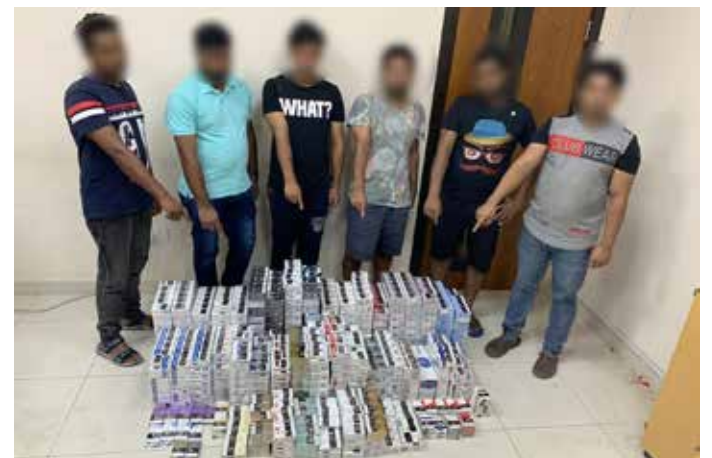
The six Asians who were arrested with the stolen packets of cigarettes

used to commit the crimes were confiscated.