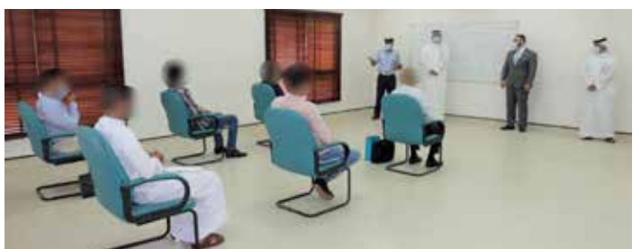
The programme taking place

It took place in cooperation with the Ministry of Youth and Sports Affairs.