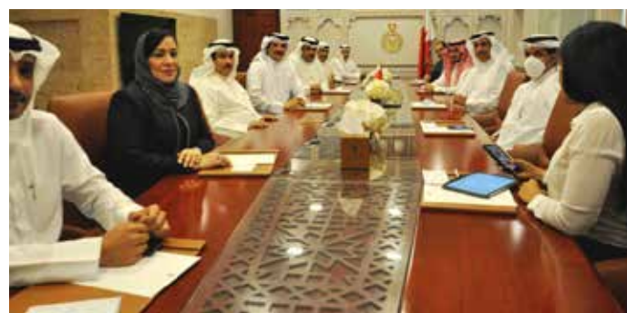
Officials during their meeting

They reviewed the Union of Beneficiaries' case and discussed mechanisms to accelerate the pace of its application on projects of ownership apartments, as the minister confirmed that the ministry is working with the Housing Bank to speed up the implementation of the union programme in various residential projects.