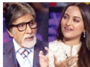
Amitabh Bachchan and Sonakshi Sinha