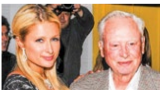
Paris Hilton and William Barron Hilton

"I always wanted to make him proud. The last conversation we had a few days ago, I told him how much of an impact he had on my life. His spirit, heart, and legacy will live on in me," she added.