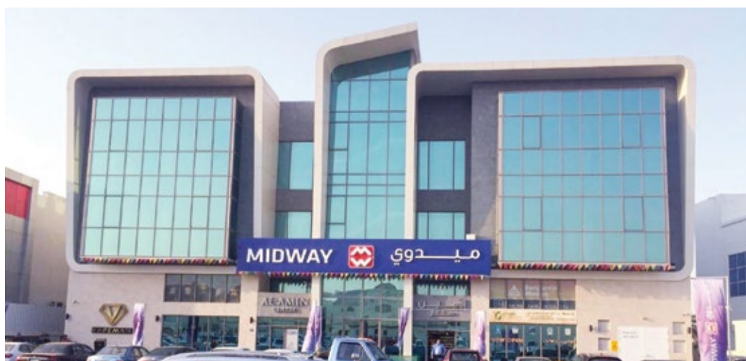
Midway Supermarket is one of the largest players in the local food market.

Midway Supermarket currently operates its outlets in Zallaq, Riffa, Hamala, Saar, Ma-