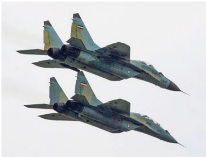
Russian-made MiG-29 fighter jets of the Iranian army fly past during a military parade to commemorate army day in Tehran.

Tehran has suggested in recent weeks that it could take military action in the Gulf to block other countries' oil exports in retaliation for US sanc-