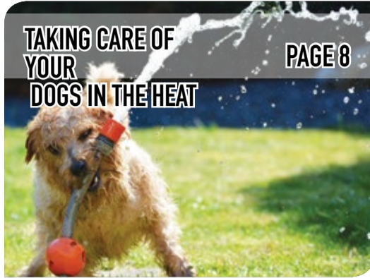
TAKING CARE OF YOUR DOGS IN THE HEAT PAGE 8