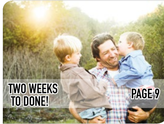
TWO WEEKS TO DONE! PAGE 9