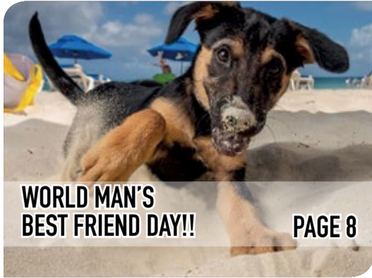
WORLD MAN'S BEST FRIEND DAY!! PAGE 8

Because every week deserves a happy ending