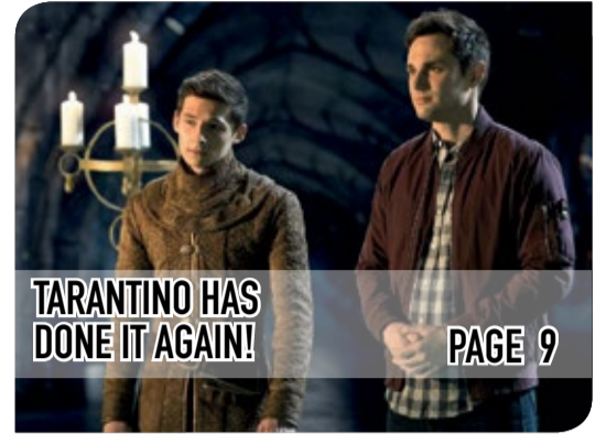
TARANTINO HAS DONE IT AGAIN! PAGE 9