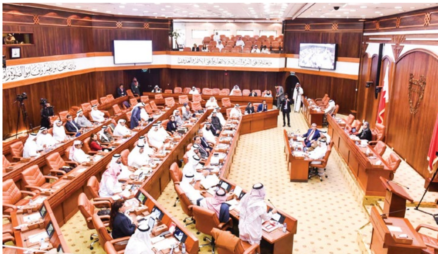
The House is expected to discuss the bill in the coming session.

According to a statement that was recently issued by the nine-member group, the jobs include nurses, accountants, engineers, teachers, physician assistants, accountant assistants, nursing assistants, recruitment staff, recruitment directors, recruitment specialist, procurement specialists, procurement officers, auditors, hotel managers, reception managers, hotel chefs, flight attendants, receptionists,