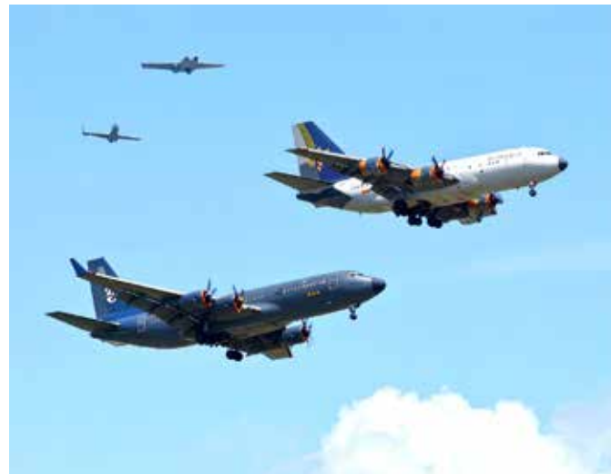
Representative picture Washington, United States

A passenger jet performed an “aggressive maneuver” to avoid a mid-air collision with a US military bomber over the state of North Dakota, according to recorded audio of the commercial pilot.