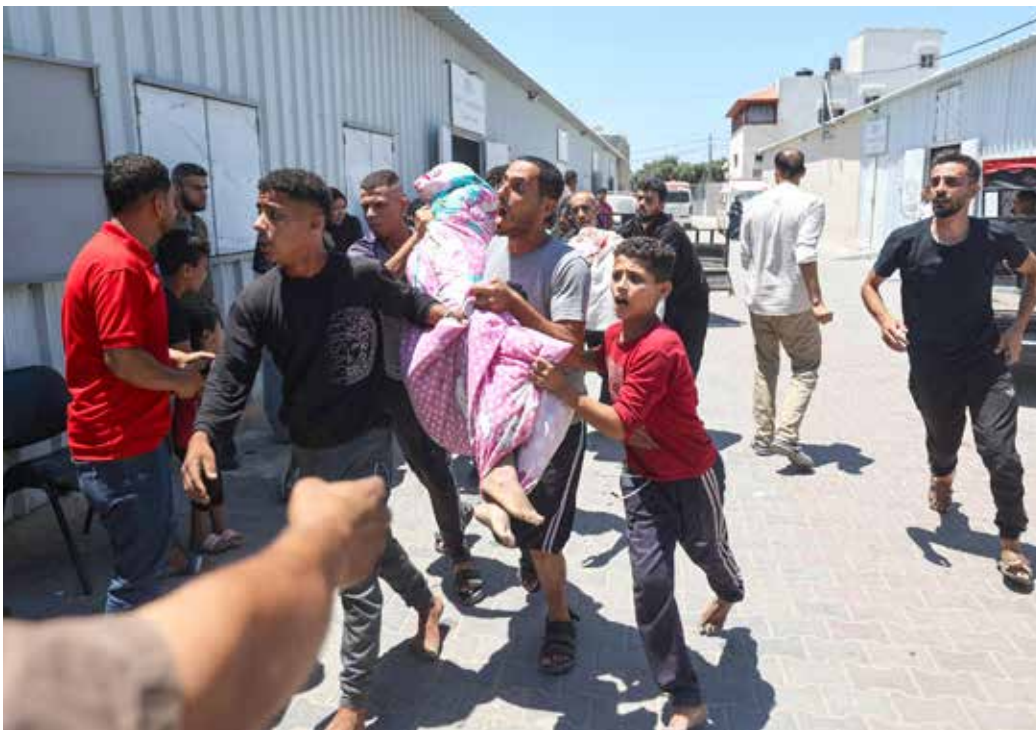
Palestinians rush a casualty of an Israeli strike on an apartment at the Nuseirat refugee camp, into Al-Awda hospital in the central Gaza Strip

Civilians’ suffering had “reached new depths”