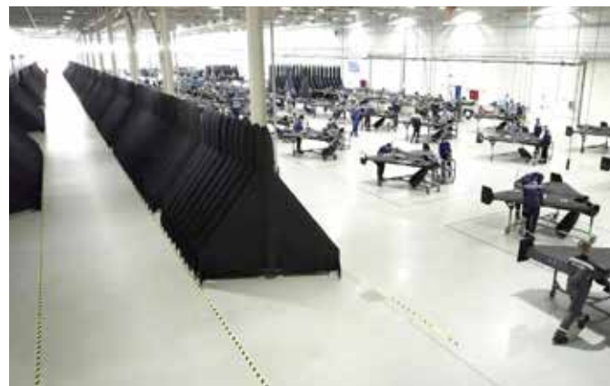
Workers assemble drones at a production facility in Russia’s Tatarstan region.