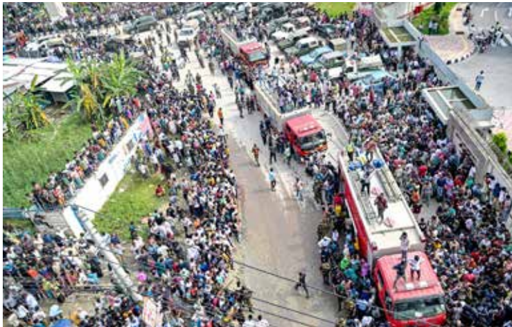
People crowd a street as fire fighting trucks remain on standby outside a school where an Air Force training jet crashed in Dhaka

"We were on the playground for the seniors. There were two fighter planes... Suddenly one of the two planes crashed here (in the junior playground)," he told AFP.