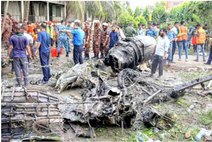
Bangladesh's fire service and security personnel conduct a search and rescue operation

"It created a boom, and it felt like a quake. Then it caught fire, and the army reached the spot later."