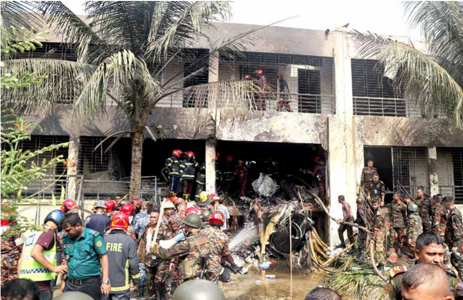
Bangladesh's fire service and security personnel conduct a search and rescue operation after an Air Force training jet crashed into school in Dhaka

He had ascribed his removal from the party politburo to his open comments against Mr Vijayan and months later, on his 90th birthday, made a series of stronger remarks.