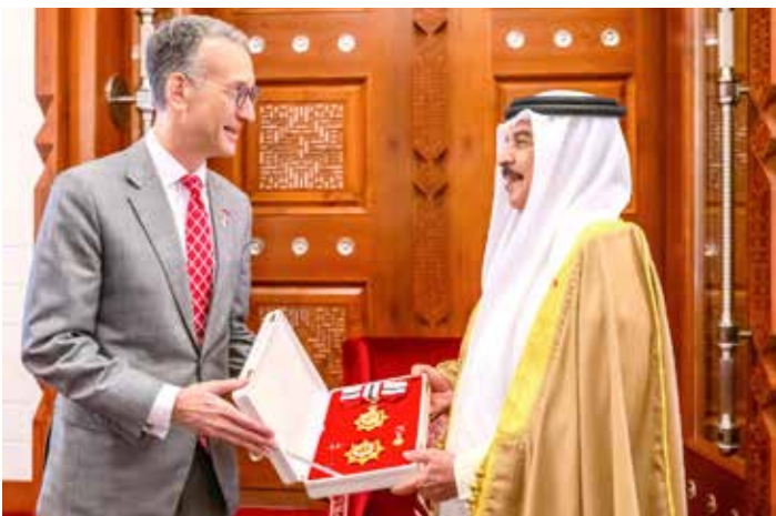
His Majesty presents the US Ambassador with the Order of Bahrain (Wisam al Bahrain), First Class

His Majesty also commended the role of the US administration on the international stage and its active efforts in promoting