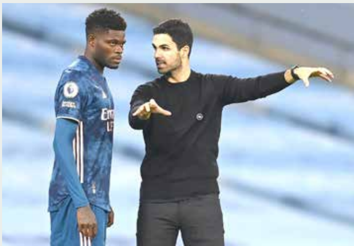
Arsenal’s Thomas Partey (L) receives directions from manager Mikel Arteta

Arsenal’s pre-season tour of Singapore whether the allegations against Partey were the deciding factor in him being released.