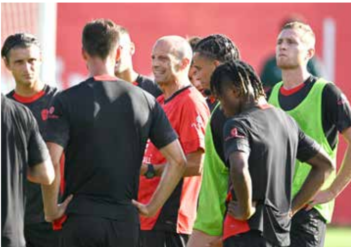
AC Milan's Italian new coach Massimiliano Allegri speaks with players during a training session