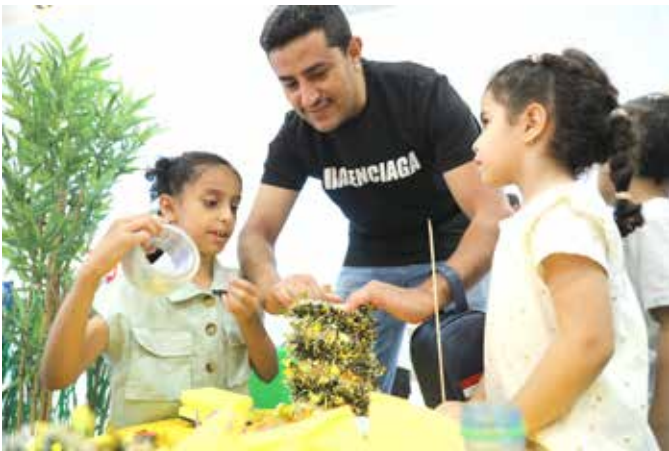
Fun and learning for kids