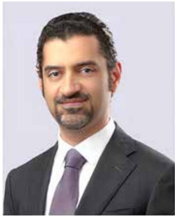
H.E. Wael bin Nasser Al Mubarak Economic Vision 2030.

H.E. Al Mubarak said the system's expansion now includes permits for renovations, fencing, subdivision, plot merging, change of land use, land reclamation (both land-based and marine), and new building modifications. He credited the platform for improving transparency and speeding up approvals while aligning services with Bahrain's