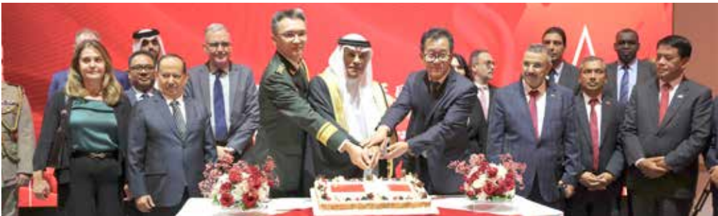
Cake-cutting ceremony is one of the highlights of the event