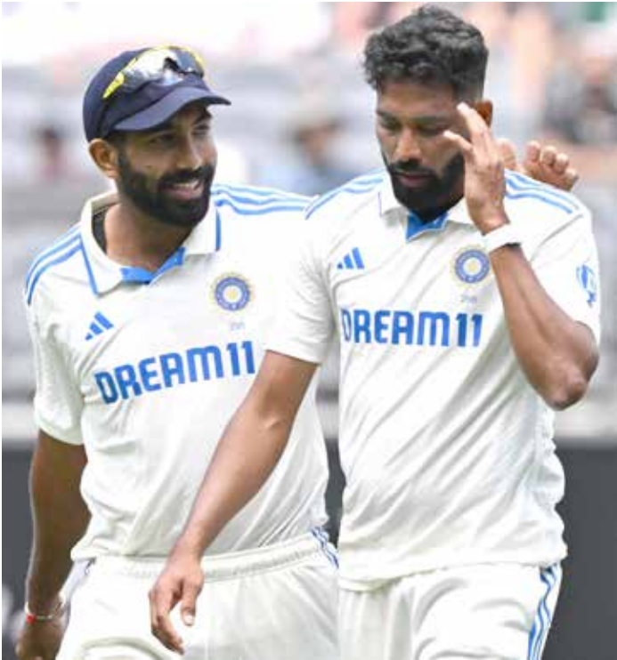
Jasprit Bumrah (L) talks with Mohammed Siraj (file photo)

India's Mohammed Siraj expects fast bowler Jasprit Bumrah to feature in the vital fourth Test against England at Old Trafford this week. Bumrah, the world's top-ranked Test bowler, is only slated to play three of the five matches against England as he battles a back injury. He has already featured in India's defeats at Headingley and Lord's, leaving the tourists 2-1 down in the series. With doubts over the availability of India seam bowler Akash Deep due to a groin injury, Siraj believes Bumrah will feature in Manchester on Wednesday rather than hold him back for next week's final Test at The Oval. "So far, we only know that Jassi (Bumrah) will play," Siraj said Yesterday. India must make at least one change as Nitish Kumar Reddy will miss the last two Tests be-