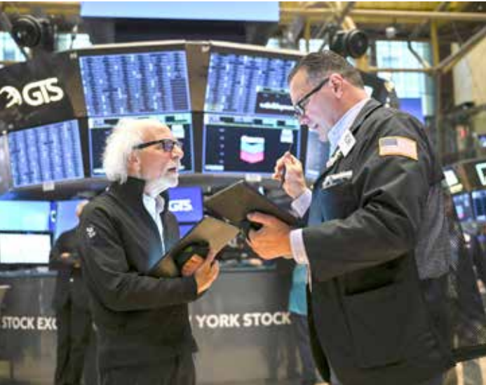
Traders work on the floor of the New York Stock Exchange (NYSE) at the opening bell

US Commerce Secretary Howard Lutnick told CBS News over the weekend he was "confident" a trade deal would be reached with the EU.