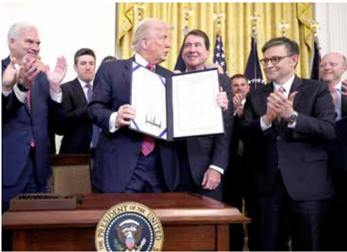
U.S. President Donald Trump holds up the "GENIUS Act" alongside applauding lawmakers after signing the bill into law during a ceremony in the East Room of the White House

ple a basic tariff on imports from the EU to 30% if Brussels does not cut a deal by the end of the month, casting uncertainty over the future of transatlantic trade.