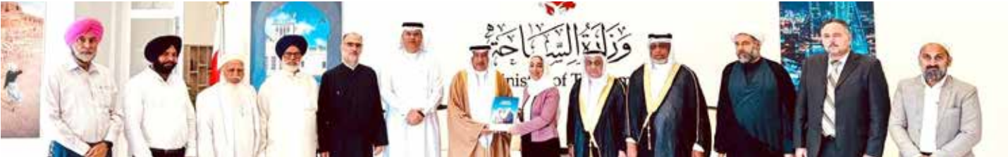
H.E. Fatima bint Jaffer Al Sairafi with 'Taa'ayosh' chairman and board members

Bahrain's tourism authorities are deepening ties with civil society to strengthen the Kingdom's image as a model of peaceful coexistence, as part of a broader national narrative on tolerance and diversity.