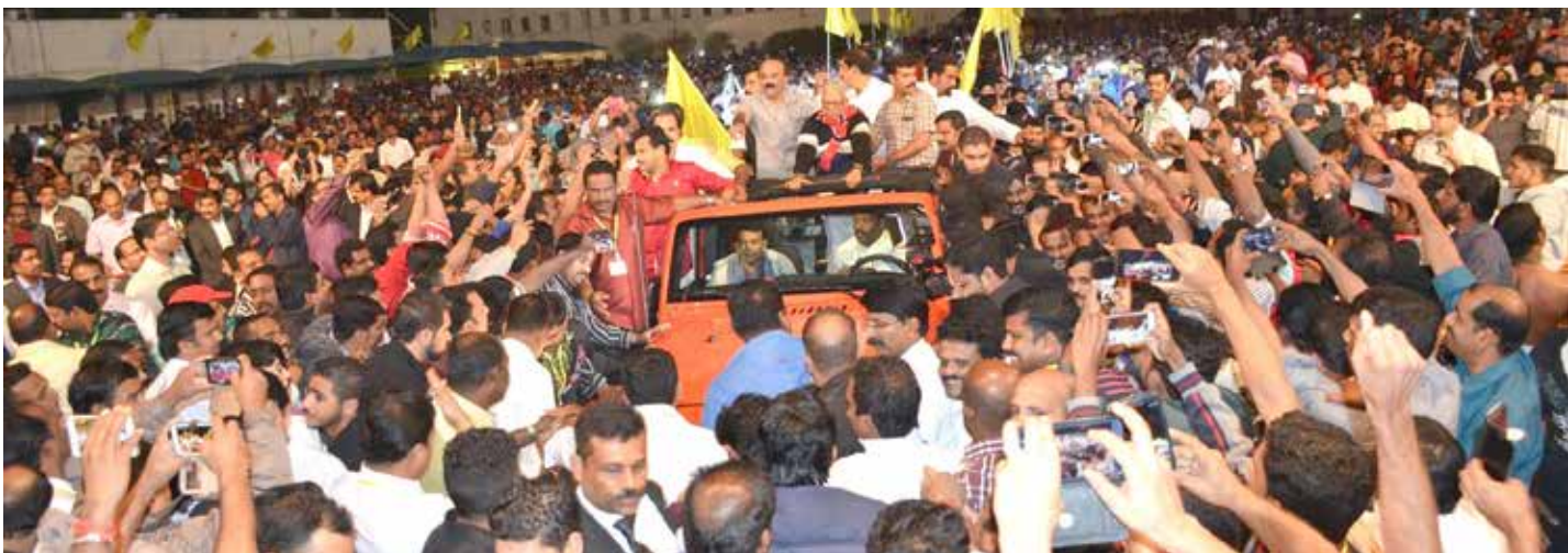
V.S. Achuthanandan receives a warm welcome from the Indian community during his visit to Bahrain

V.S. Achuthanandan, the towering Communist leader and former Chief Minister of Kerala, passed away aged 101, prompting a wave of remembrance across the Indian diaspora in Bahrain. Though best known for his relentless fight against corruption and advocacy for the underprivileged, Achuthanandan also carved a place in the hearts of Malayalis abroad, particularly through his 2015 visit to Bahrain.