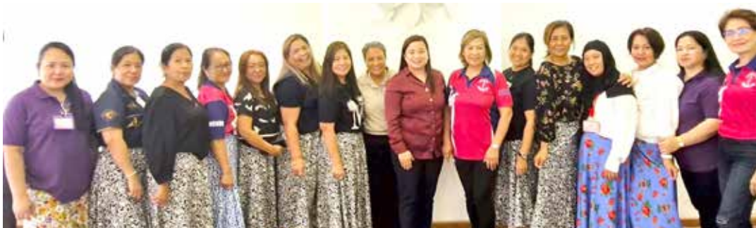
Unique dressmaking projects by students, proudly worn by Filipino women

The uniqueness of the outfit showed the students' perseverance and growing mastery of