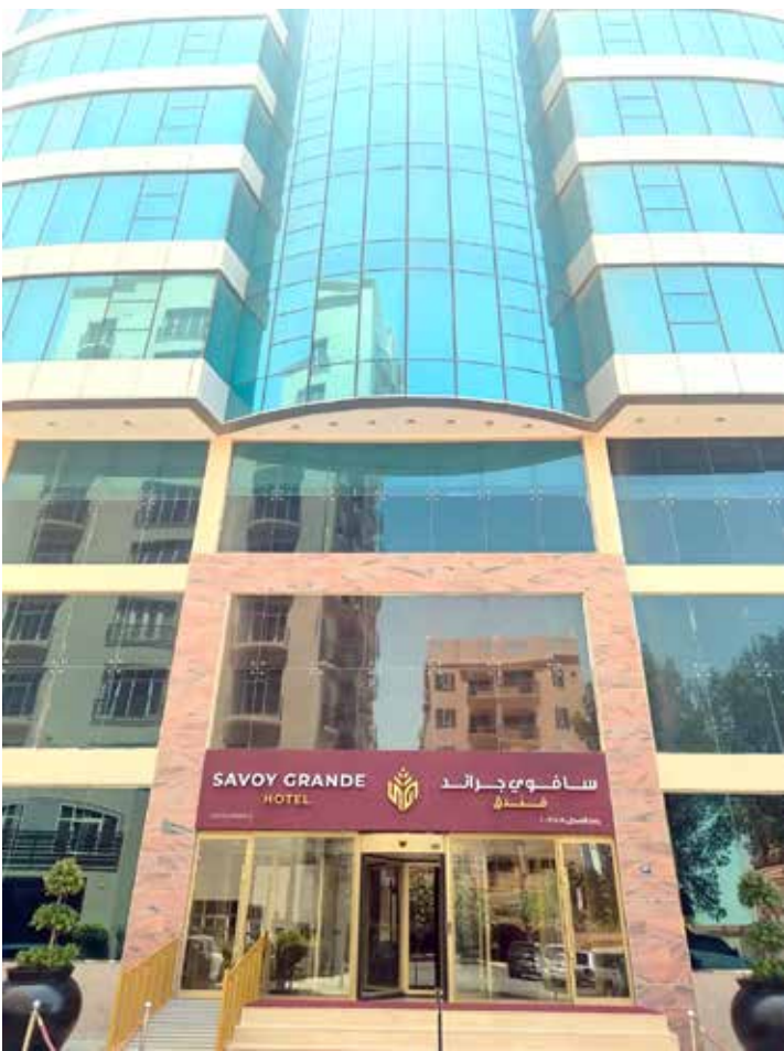
The striking façade of Savoy Grande Hotel & Spa in Al Seef stands as a bold new symbol of luxury, comfort and elevated hospitality in the heart of Bahrain. The player in Bahrain’s competitive hotel sector. More information is available at www.savoygrandehotel.com

is its culinary diversity. The property houses seven distinctive dining concepts, including Japanese restaurant Mizo, authentic Chinese cuisine at Chow, a casual all-day café, and The Aviary, a rooftop venue with panoramic sea views. Guests can also unwind at Winners Lounge sports bar, enjoy cigars and premium spirits at The Cigar Vault, or soak in the breeze at Reef Garden on the 12th floor. With its mix of comfort, service, and location, Savoy Grande is expected to become a notable