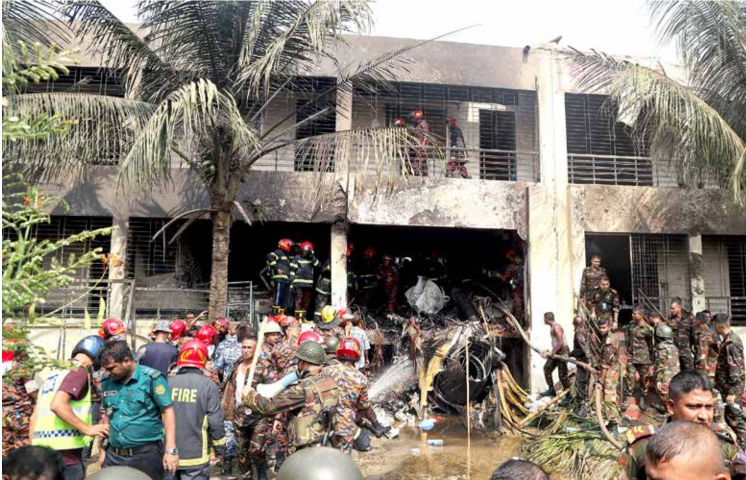
Bangladesh's fire service and security personnel conduct a search and rescue operation after an Air Force training jet crashed into school in Dhaka

He had ascribed his removal from the party politburo to his open comments against Mr Vijayan and months later, on his 90th birthday, made a series of stronger remarks.