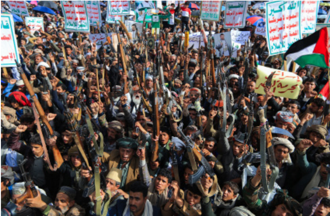
Yemenis brandish their rifles and chant slogans during a rally in solidarity with Palestinians and in condemnation of Israel and the US, in the Huthi-run capital Sanaa

In its latest raids, Defence Minister Israel Katz said Israel struck "targets of the Huthi terror regime at the port of Hodeida" and aimed to prevent any