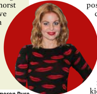
Candace Cameron Bure

"When it comes down to it, I just want [their significant others] to love Jesus the way I love Jesus," Bure told Us magazine.