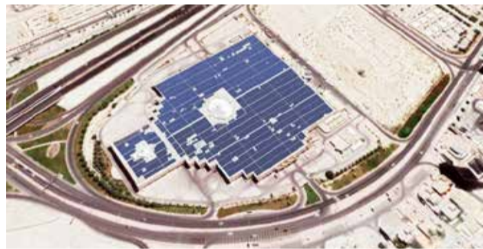
An artist's impression of the largest solar energy system project at The Bahrain Mall

The national renewable energy plan revolves around three main policies and seven projects, and that the national goal aims to increase the share of renewable energy in the total energy mix by 5%, equivalent to about 250 megawatts by 2025 and by 10% by 2035.