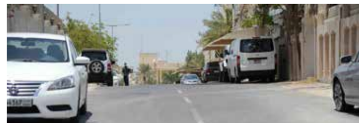
Part of the area where the project will be implemented

The Ministry stated that the project works include the civil