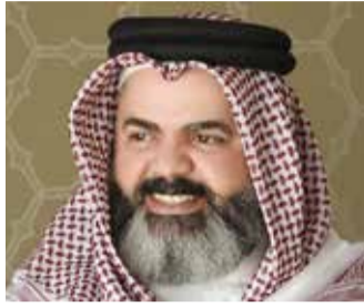
Dr Al Shihabi

The United Nations Economic and Social Council meeting in New York yesterday approved the recommendation of the Committee on Non-Governmental Organisation Affairs to grant the Bahrain Public Relations Society (BPRS) special consultative status with the Council.