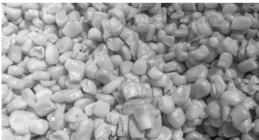
It is suspected that many sweetcorn products got infected with the bacteria.

"The Ministry received a notification from The International Food Safety Authorities Network (INFOSAN) of the World Health Organisation with regards to concerns about frozen products by the Penguin brand. In its notification, the organization informed about the Listeria outbreak and the withdrawal of the products from markets of a number of European Union countries," the ministry stated.