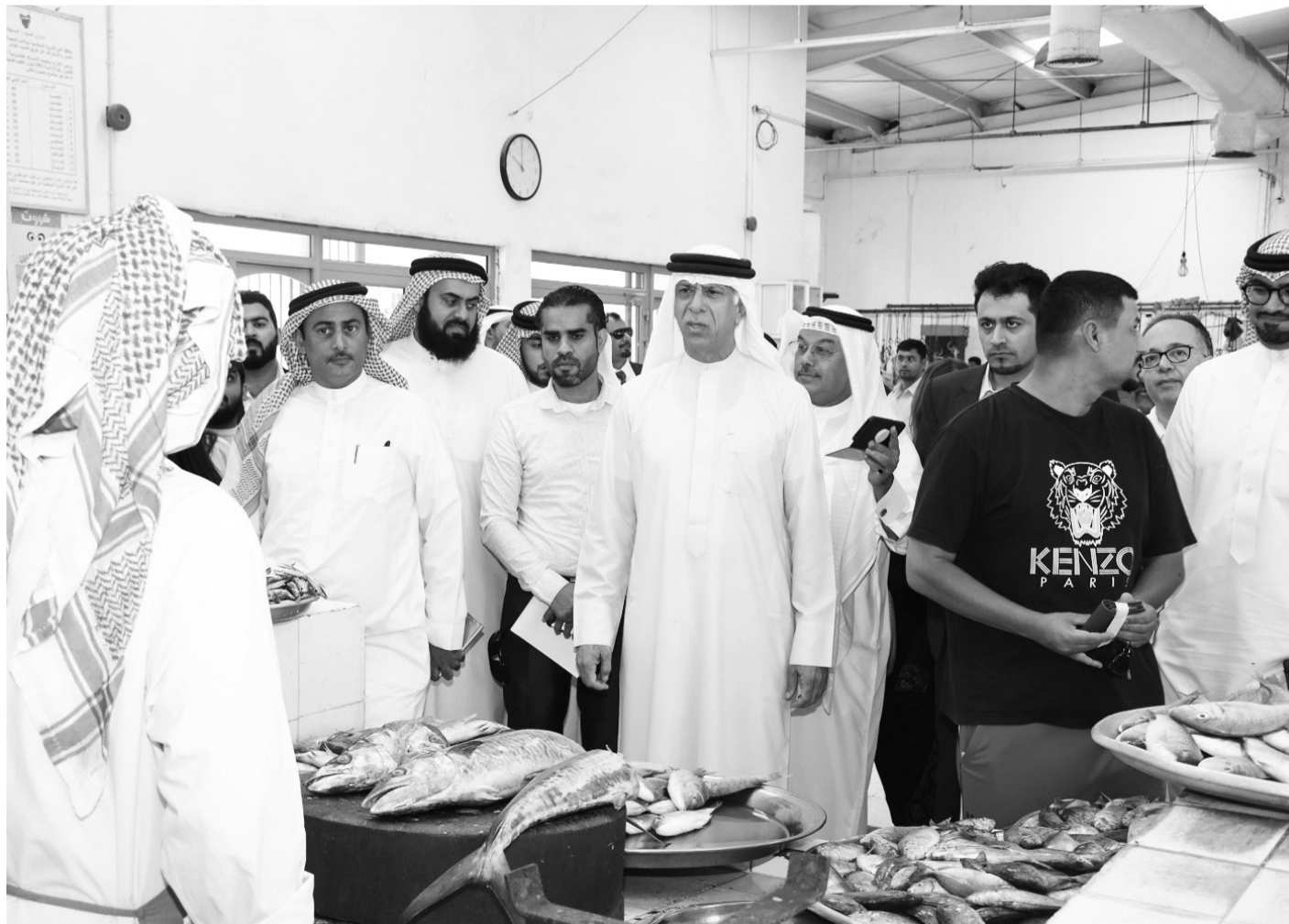
The delegation interacting with traders at a market.