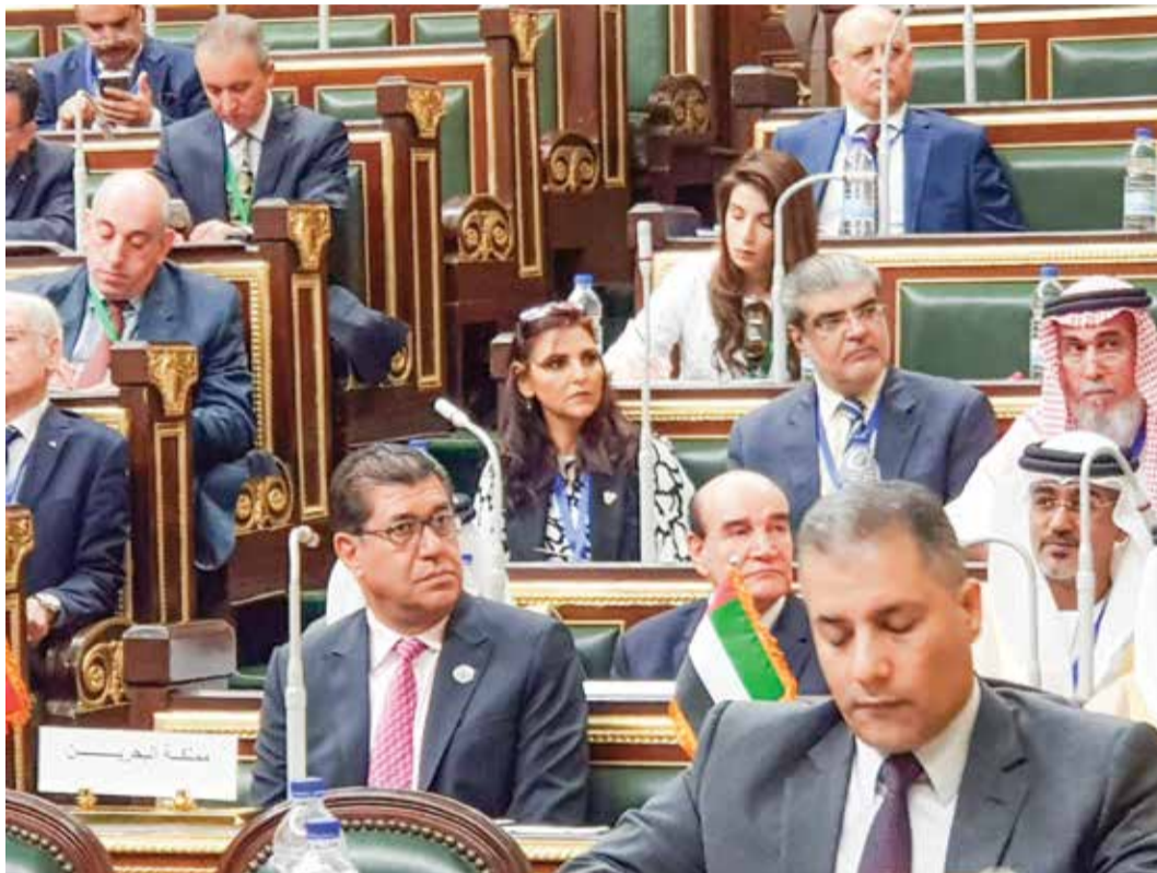
The Bahraini delegation at the 28th extraordinary session of the Arab Inter-Parliamentary Union.

She said that such abhorrent practices contravene all norms,