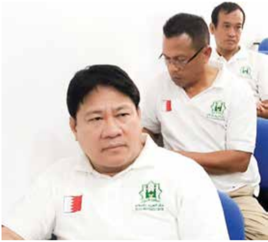
Filipino members are offered classes in Tagalog at the centre.

According to Mr Al Wazzan, most of the people who embraced Islam through the centre were Filipinos. He said, "The centre's annual statistics indicate that Filipinos have more tendency to join Islam than people from other nations. The latest figures showed that a total of 243 nationals of the Philippines from both genders converted to Islam in 2017. There were less than 20 individuals joining from each of the other nationalities, which included India, Sri