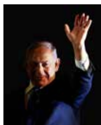
Former Prime Minister Benjamin Netanyahu

The prospect of an election as early as October - delighted Netanyahu, Israel’s longest-serving leader who was toppled a year ago after Bennett mustered a rare coalition of hard-right, liberal and Arab politicians.