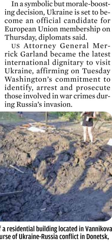
A residential building located in Vannikovo, a site of destruction from the Ukraine-Russia conflict in Donetsk.