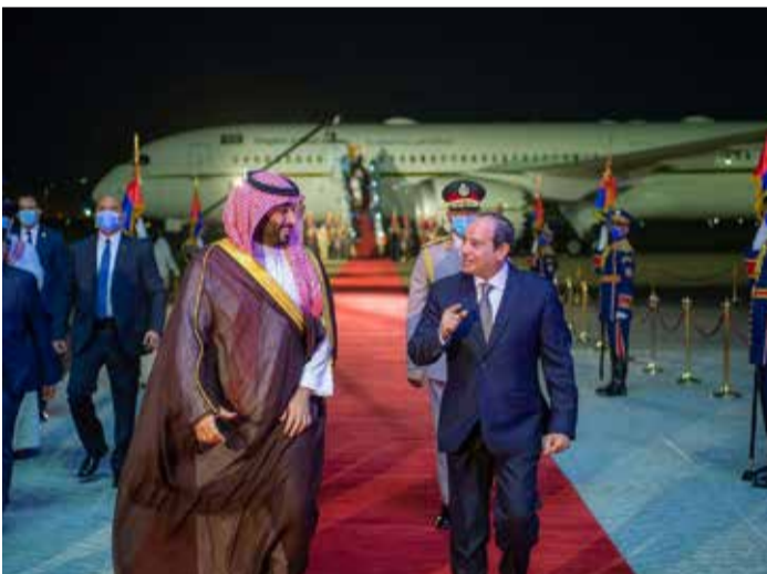
Saudi Crown Prince Mohammed bin Salman is received by Egyptian President Abdel Fattah al-Sisi upon his arrival in Cairo, Egypt

The prince and Sisi discussed trade, investment and security, as well as a regional summit in Saudi Arabia next month that will be attended by US President