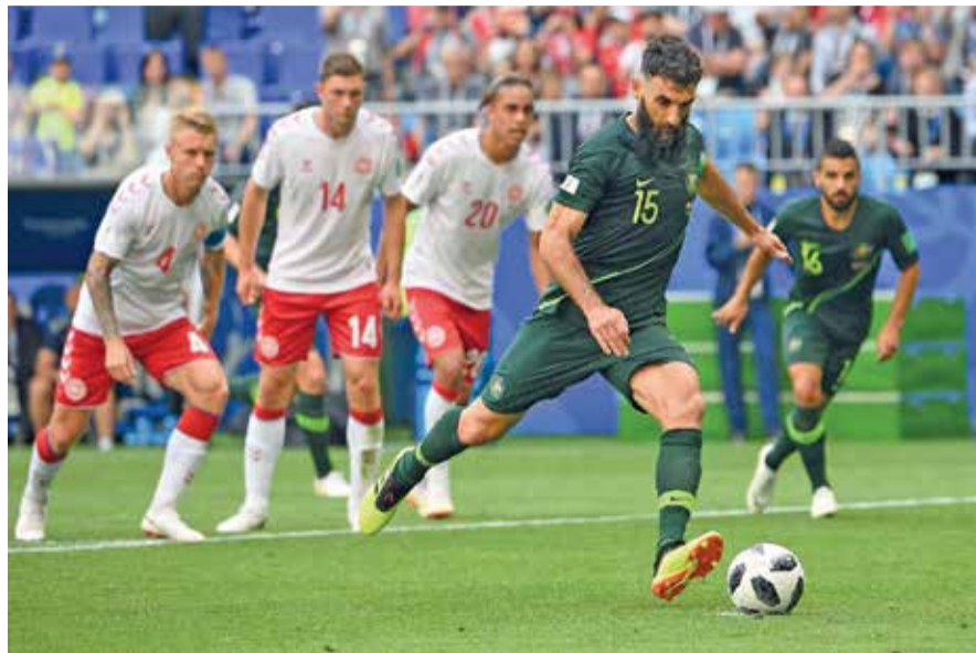
Australia's midfielder Mile Jedinak scores from the penalty spot for Australia's first goal to equalise 1-1 during the Russia 2018 World Cup Group C football match between Denmark and Australia at the Samara Arena in Samara

Denmark moved on to four points and need at least a draw against France in