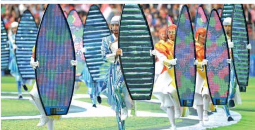
Performers during the opening ceremony