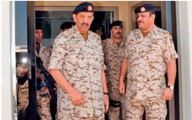
BDF commander during an inspection visit