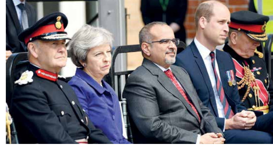
HRH Crown Prince Salman bin Hamad Al Khalifa with British Prime Minister Theresa May during the opening ceremony of Defence and National Rehabilitation Centre at the Stanford Hall Estate, Nottinghamshire, UK.

mutual interest, noting, in partrade and economic ties. ticular, the longstanding secu-