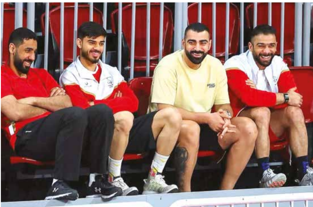
Bahrain's handball stars and national football goalkeeper Ebrahim Lutfalla support the team from the stands