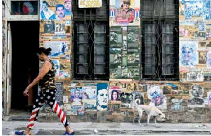
A woman wearing leggings bearing the flag of the United States, and a dog, walk past a house displaying a poster of the late Venezuela's leader Hugo Chavez, former Cuba's president Raul Castro and late revolutionary leader Argentine-born revolutionary leader Ernesto "Che" Guevara, in Havana

abroad slammed the indictment, the latest step-up in Trump's international interventions after the Iran war, the US toppling of Venezuelan president Nicolas Maduro and threats against Greenland.