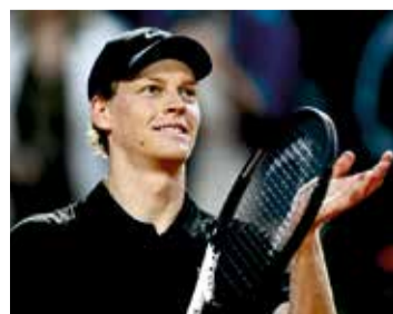
Jannik Sinner reacts during a match

Sinner, the red-hot men's title favourite in the absence of injured rival Carlos Alcaraz, will start his bid for a maiden Roland Garros crown against French