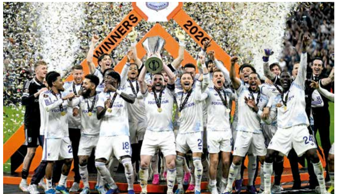
Aston Villa celebrate winning the Europa League

"I am myself ambitious and of course I need support. The owners, everyone that works