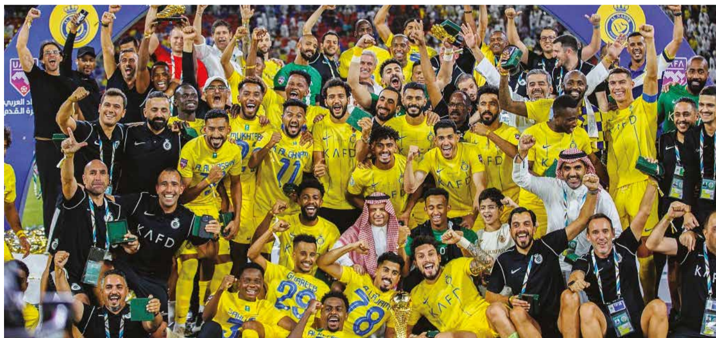
Al Nassr celebrate their 11th Saudi Pro League title

Al Nassr doubled their advantage in the second half when