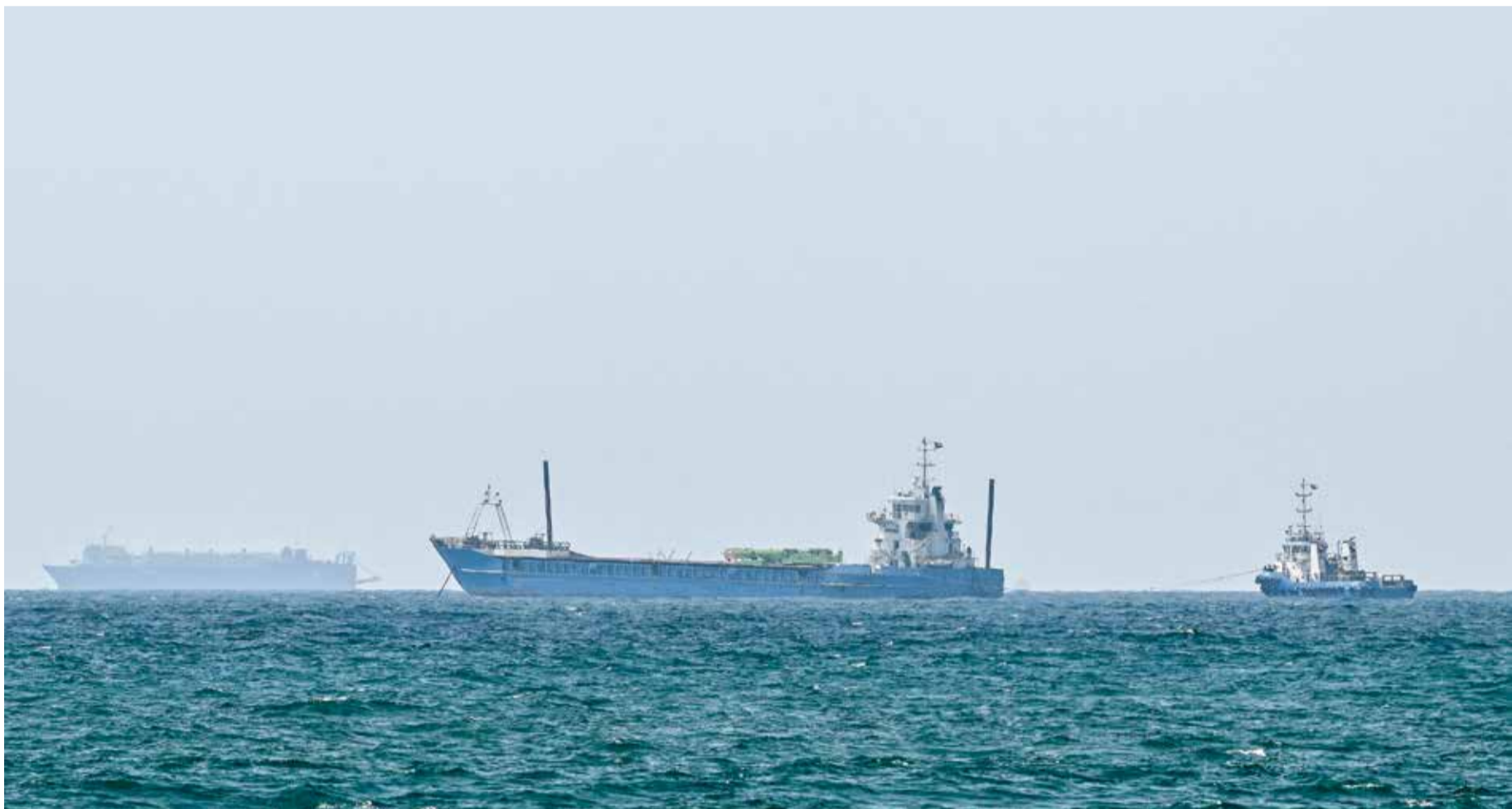
Vessels are anchored off the coast of Sharjah in the United Arab Emirates

The Cuban government said in a statement that the 1996 shutdown was "legitimate self-defense" against an airspace violation.