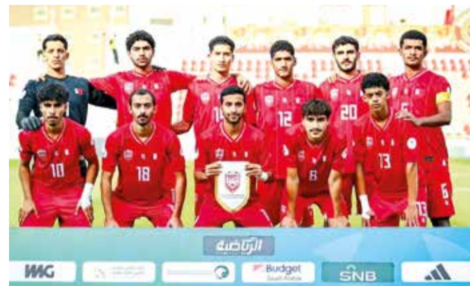
Bahrain's U-20 national football team line up ahead of kick-off