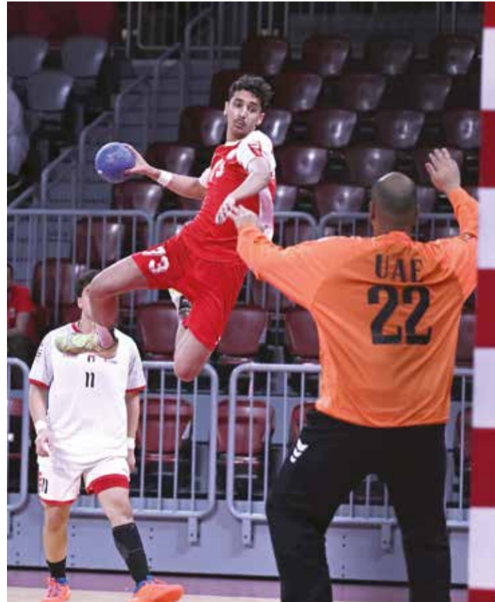
Action from the match

The second half followed a similar pattern. Mohamed Rabia finished a well-worked move to extend the lead before Ali Mo-