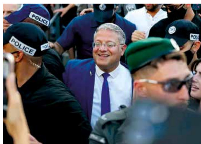
Israel's National Security Minister Itamar Ben Gvir (C) takes part in the Jerusalem Day parade at the Damascus Gate

In Ireland, a leaked letter revealed Prime Minister Micheal Martin urging the EU chief for "further action" against Israel