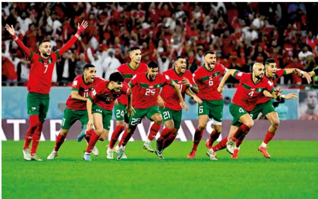
Moroccan players celebrate historic shootout victory over Spain at 2022 World Cup

At that tournament, the Moroccans produced one of the most remarkable runs in modern World Cup history, becoming the first African and Arab nation to reach the semi-finals before ultimately finishing fourth. Their campaign was defined by a record-setting defensive structure, conceding only one goal from open play prior to the