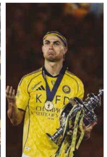
Cristiano Ronaldo poses with the Roshn Saudi League trophy

a personal turning point. Ronaldo arrived in Saudi football amid questions about his motivation and the level of competition. Once again, he answered through performance and goals on the pitch.