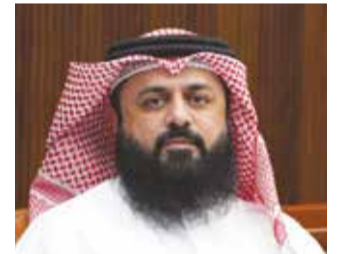
Jameel Mulla Hassan, MP

MPs said the move aimed to recognise the role played by Bahrain's armed forces in pro-