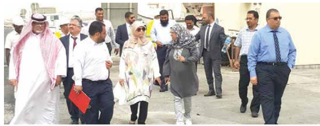
Works Ministry officials inspect the site