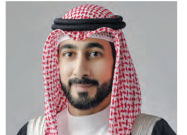
MP Bassam Albinmohamed