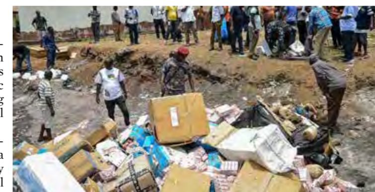
Members of the Sierra Leone National Drugs Enforcement Agency pile up narcotics kush, drugs and chemicals in Freetown