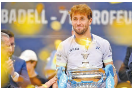
Casper Ruud celebrates his win

Ruud, a three-time Grand Slam runner-up, had won 10 titles at 250 level with the 500-ranked clay-court event in Barcelona his 11th career triumph.