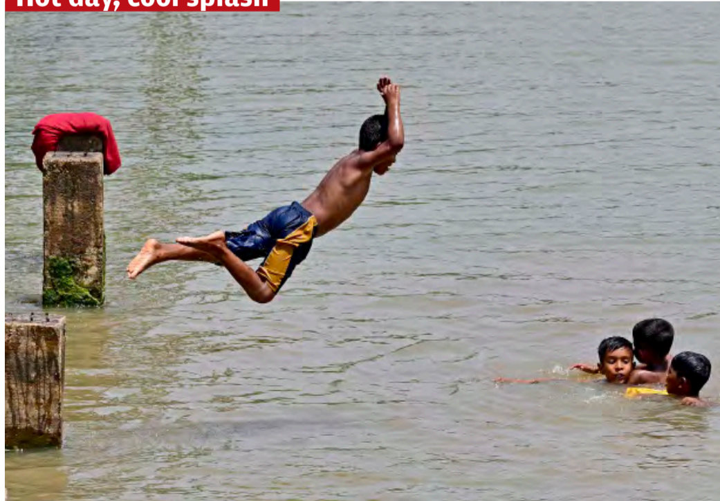
A boy dives in a lake to cool himself on a hot day in Dhaka.