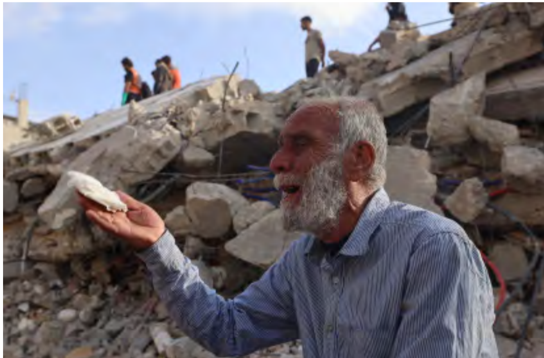
A Palestinian man wait for news of his daughter as rescue workers search for survivors under the rubble of a building hit in an overnight Israeli bombing in Rafah, in the southern Gaza Strip.

said its teams had discovered 50 bodies since Saturday buried in the courtyard of the Nasser Medical Complex in Gaza's main southern city of Khan Yunis.