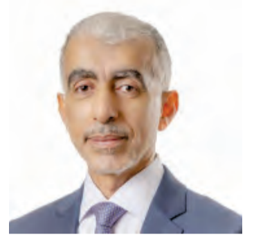
H.E. Ebrahim Al Hawaj

These projects are tailored to enhance the road network in tandem with ongoing development and the burgeoning number of vehicles. The first phase included 12 projects, followed by 15 in the second, 10 in the third, and 11 in the fourth phase.