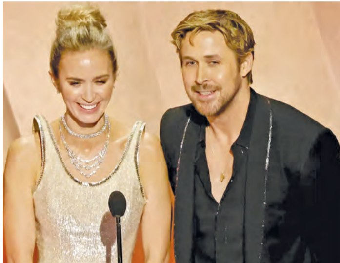
Emily Blunt and Ryan Gosling

The musical moment happened when guest host Ryan explained he had gone "too deep" with his 'Barbie' alter ego Ken so they "had to break up" and while he initially didn't want to discuss the subject, he ultimately felt the best idea was to sing about his feelings.