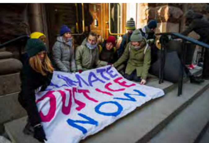
Swedish climate activist Greta Thunberg (3rd L) and a group of fellow activists block the main entrances of the Swedish Parliament during a protest due to the lack of action from the Swedish authorities