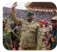
Hundreds in Niger tell US troops to go home

Landslide win for pro-China leader's party in Maldives vote