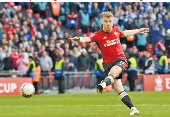
Manchester United forward Rasmus Hojlund scores the winning penalty

Simms and Callum O'Hare gave the 1987 FA Cup winners hope and Haji Wright levelled from the penalty spot in the 95th minute, capping a scarcely credible comeback.