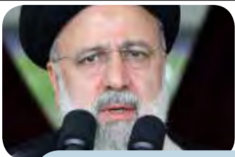
Iran president to visit Pakistan, boost ties: Islamabad

Iran's President Ebrahim Raisi will travel to Islamabad today to meet his Pakistani counterpart Asif Ali Zardari, Pakistan's foreign minister said, as the two countries seek to mend ties following deadly cross-border attacks this year. Raisi will be accompanied by "a high-level delegation comprising the foreign minister... as well as a large business delegation," the foreign ministry said in a statement yesterday. Raisi will also visit Lahore and Karachi to meet provincial leaders, according to the statement. Pakistan is counting on a joint gas project with Iran to solve a long-running power crisis that has sapped its economic growth.