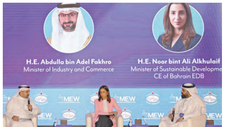
Ministers discuss shaping Bahrain's Sustainable Future