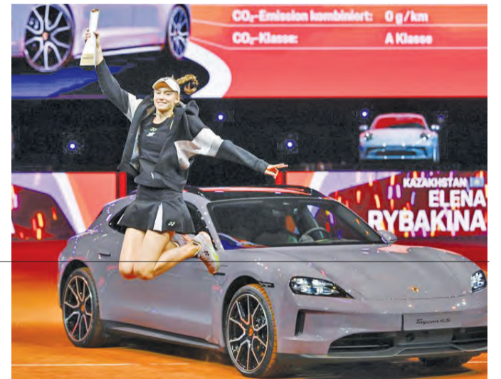
Kazakhstan's Elena Rybakina holds her trophy as she jumps in front of her prize, a Porsche Taycan 4S Sport Turismo car