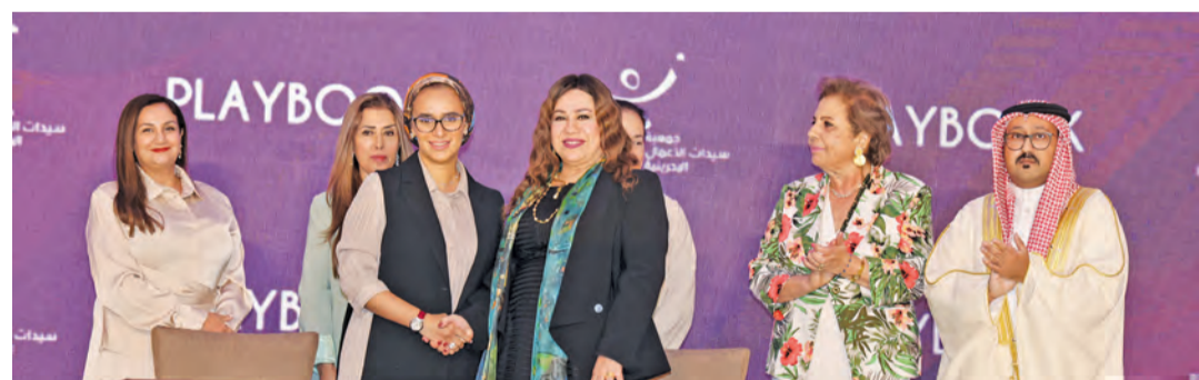
MOU signing between PLAYBOOK, Bahrain Businesswomen's Society and Capital Governorate

The week will be full of a variety of seminars and workshops conducted in partnership with prominent organizations like Kuwait Finance House, BMMI, and the University of Bahrain. Participants can expect discussions on smart city solutions and how entrepreneurs can drive positive change in urban environments.