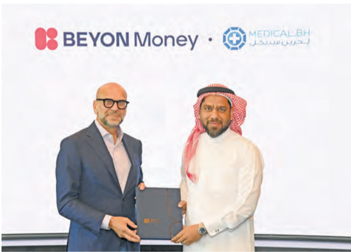
The deal signing

The Beyon Money cashback deal is currently available with a growing number of Medical.BH's providers including:-