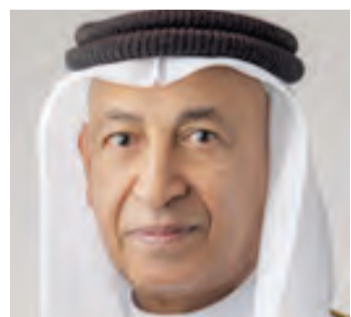
MP Ali AlHaddad

Recruitment agencies will be prohibited from exceeding these stipulated caps, thereby