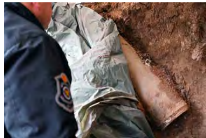
An unexploded bomb from the 1999 NATO bombing at a construction site in Nis, southern Serbia