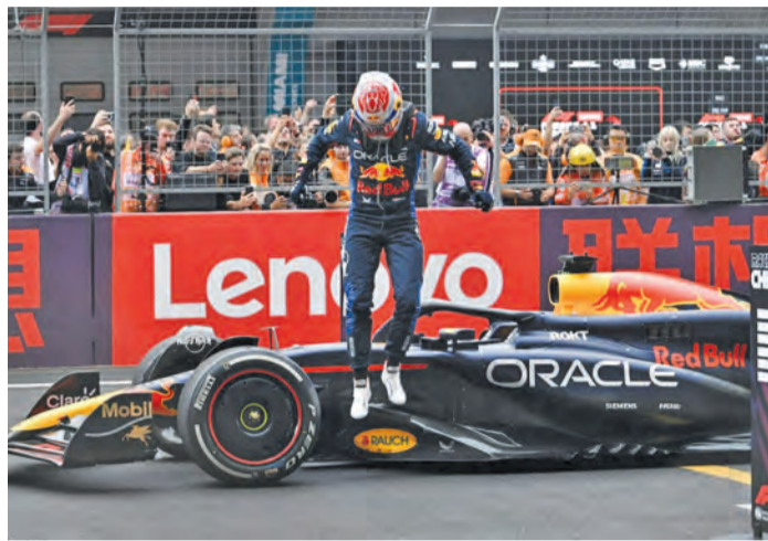
Max Verstappen celebrates after winning

It was another masterful display from Verstappen, who was winning his fourth grand prix out of five in 2024 and the