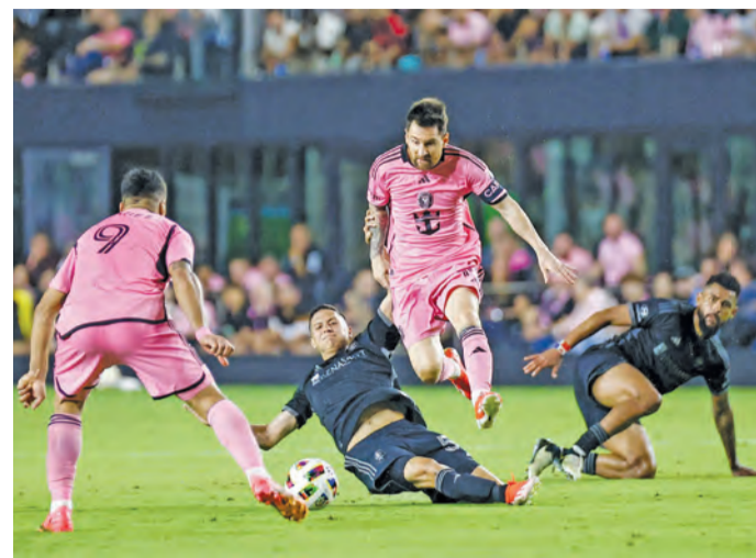
Inter Miami's Argentine forward #10 Lionel Messi (C) fights for the ball with Nashville's midfielder #54 Sean Davis (2nd L)

“Regardless of how fortunate their goal was, we didn't start well in the first few minutes. They were more focused, more intense, they handled the ball better, they pressed