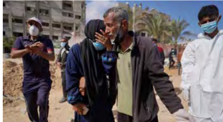
Palestinians react after the body of a relative was found buried by Israeli forces in Nasser hospital compound in Khan Yunis in the southern Gaza Strip

He alleged some of those killed had been tortured. "There were no clothes on