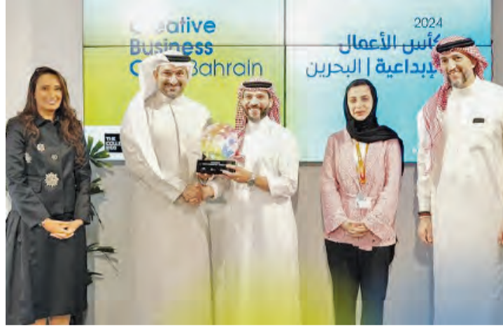
H.E. Mr. Abdullah bin Adel Fakhro with the winners

It aimed to catalyze the Bahraini economy, forging pathways to develop projects in collaboration with leading investors, corporations, accelerators, and startups worldwide.