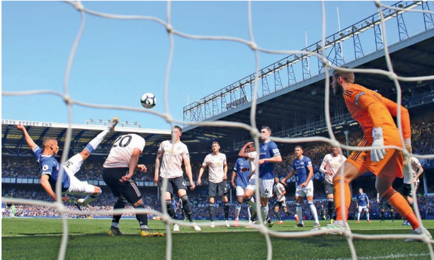
Richarlison acrobatically scores the opening goal for Everton

Four-star Everton pile on the agony for Man United boss Solskjaer