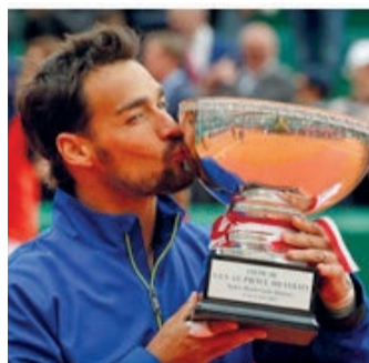
Winner Italy's Fabio Fognini kisses the trophy after winning the final ATP tennis match against Serbia's Dusan Lajovic

ajovic was playing in the first ATP final of his career and got to the title match without the loss of a set.