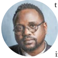
Brian Tyree Henry