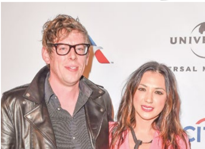
Patrick Carney and Michelle Branch