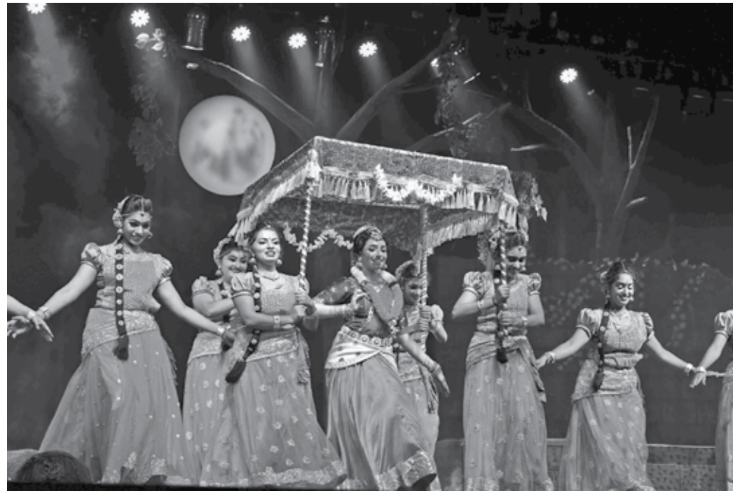
Actors perform during a scene in 'Kamala'

Since childhood, Sneha would never leave an