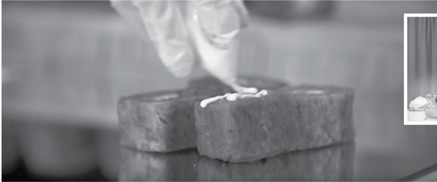
Budoor Al-Solami giving the final touch to a dish