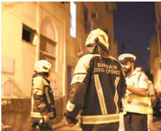
Minor injuries reported after a gas cylinder explosion in Muharraq, 2024