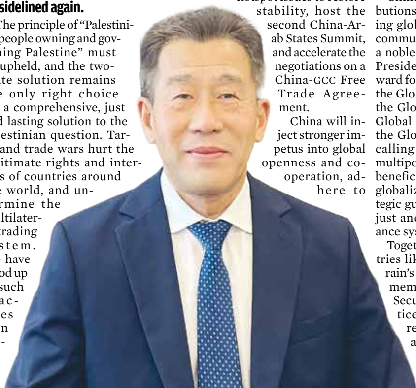
(The views and opinions expressed in this article are those of the author and do not necessarily reflect the official policy or position of the Daily Tribune)

Together with like-minded countries like Bahrain, and upon Bahrain's term as the non-permanent member of the United Nations Security Council, we will practice true multilateralism and remain a steadfast defender and contributor to the current international system.