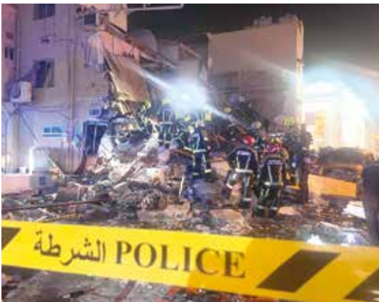
Deadly gas cylinder explosion in Arad leads to one death and four injuries, 2025

the importance of public awareness and safety measures.