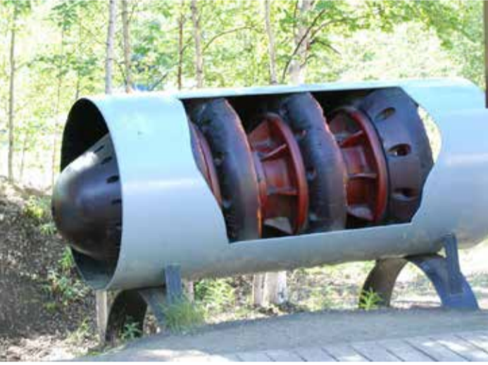
A pig on display in a section of cutaway pipe, from the Alaska Pipeline

Techno-line Trading & services, Tylos building material, Al Janan Technical Trading, Everon Trading and Services, Enerserv,