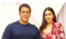
Salman Khan and Sara Ali Khan

They bumped into Salman outside the studio and, after exchanging smiles, it was the turn to exchange greetings.