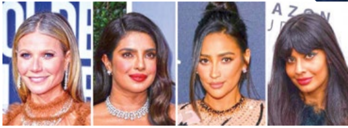
From left: Gwyneth Paltrow, Priyanka Chopra Jonas, Shay Mitchell, Jameela Jamil