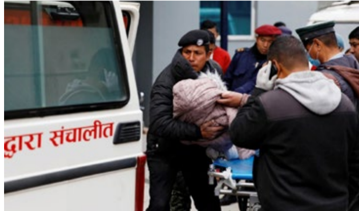
Hospital staff observe as the bodies of eight Indian tourists who died due to suspected suffocation are carried inside an ambulance while being taken for postmortem in Kathmandu, Nepal