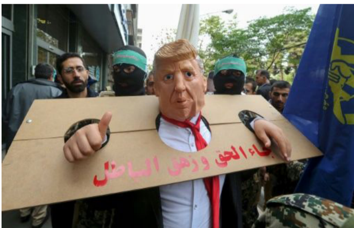
Public opposition to Washington already ran high in Iran even before a US drone strike killed storied Revolutionary Guards commander Major General Qasem Soleimani in Baghdad earlier this month

the bounty offer, which comes a month ahead of a parliamentary election.