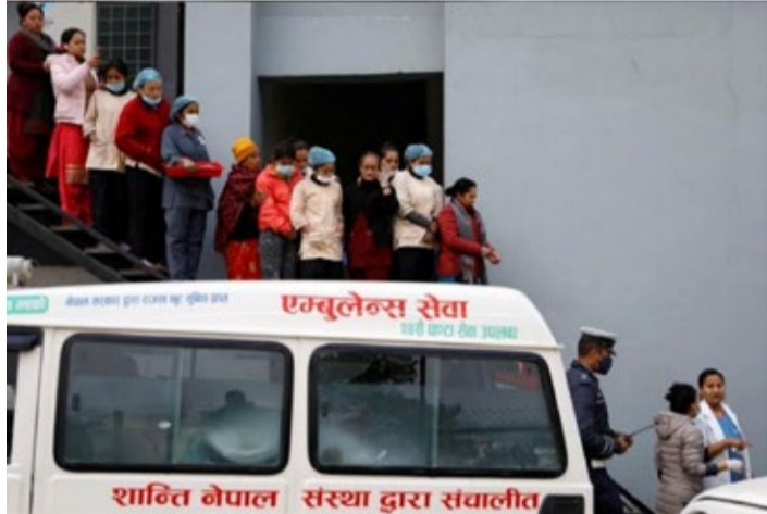
The body of a child who is among the victims is being carried inside an ambulance