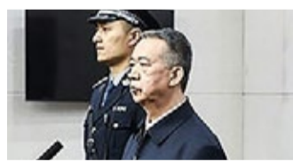
Former Interpol chief Meng Hongwei

His wife was granted political asylum in France last year,