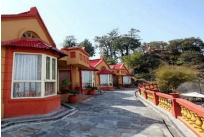
This undated image shows the cottages of Everest Panorama Resort in Daman, Thaha Municipality, Makawanpur District.